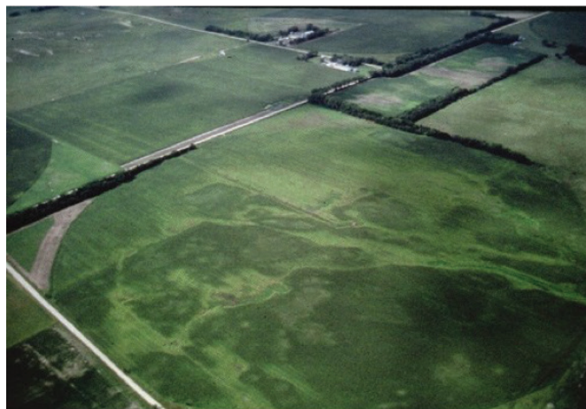
Figure 2. Iron chlorosis in soybean, western Nebraska.

ment. The fertilizer rate can be 1 to 4 lb/ac of product, depending on the anticipated degree of chlorosis. Fe-EDDHA is a dry powder that mixes easily with water. The producer should dissolve the powder in 20 to 25 gallons/ac.