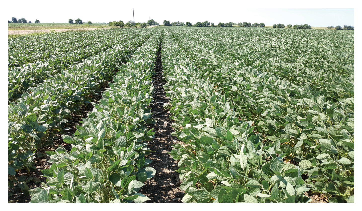
Figure 3. Excellent weed control with a pre-emergence herbicide with multiple sites of action followed by a post-emergence application of XtendiMax at 22 fl oz/acre with labeled adjuvants in Roundup Ready 2 Xtend* soybean in south-central Nebraska. The photo was taken July 28, 2017.