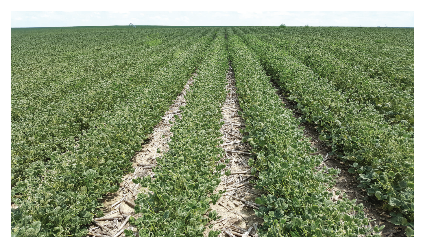
Figure 4. Dicamba off-target injury in sensitive soybean in a production field in south-central Nebraska. The photo was taken July 28, 2017.