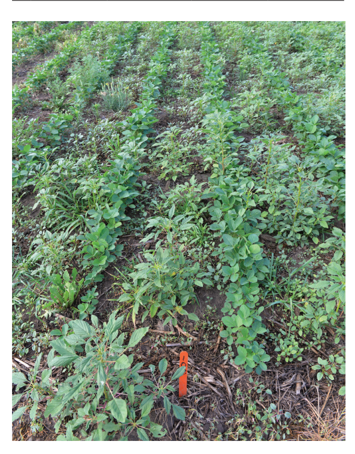
Figure 1. Palmer amaranth resistant to glyphosate and acetolactate synthase- (ALS-) inhibiting herbicides in soybean field in south-central Nebraska. The photo was taken June 19, 2018.