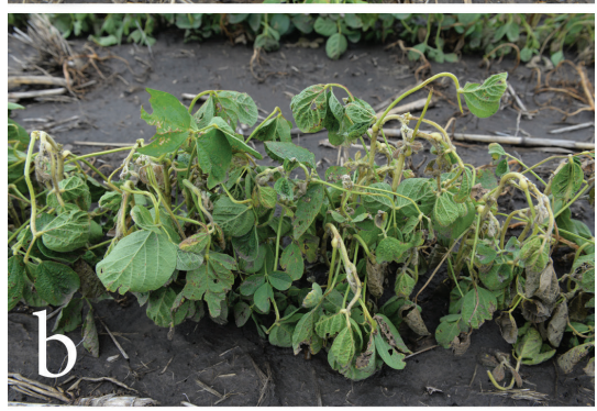
Figures 5a and 5b. What NOT to Do: Apply dicamba (XtendiMax*) on LibertyLink* soybean. Both photos were taken on June 25, 2018, in a project conducted at South Central Agriculture Lab near Clay Center, Nebraska.