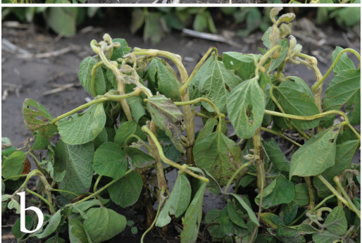
Figures 7a and 7b. What NOT to Do: Apply 2,4-D choline (Enlist One*) on Roundup Ready 2 Xtend* soybean. These photos were taken June 25, 2018, in a project conducted at South Central Agriculture Lab near Clay Center, Nebraska.