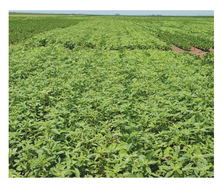
Figure 2. Glyphosate and acetolactate synthase (ALS)-inhibiting herbicide-resistant waterhemp is widespread in eastern Nebraska. The photo was taken July 9, 2013.

increased rapidly. It is expected that about 60% of soybean in Nebraska would be Roundup Ready 2 Xtend* in 2020 (personal communication with Bayer Crop Science). The reason for rapid adoption of Roundup Ready 2 Xtend* soybean is primarily for control of glyphosate-resistant broadleaf weeds such as waterhemp, marestail (aka horseweed), and Palmer amaranth (aka carelessweed) (Figure 3) and to protect their soybean from dicamba off-target injury (Klein et al. 2018; Werle et al. 2018) (Figure 4).