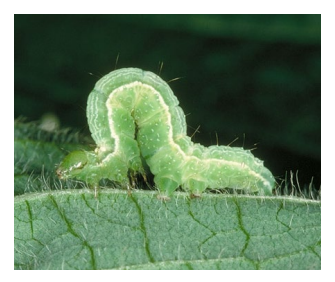
Soybean looper

Multiple species of loopers can be found in soybean fields. They are pale green and can be distinguished from green clover worm by the presence of two pairs of prolegs. Loopers typically add to a complex of defoliators in soybean fields.