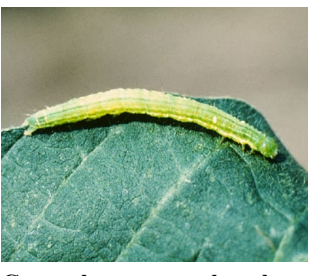
Green cloverworm

Besides the caterpillars already mentioned, a number of other caterpillars can defoliate soybean. The other species include yellowstriped armyworm (Spodoptera ornithogalli), fall armyworm (Spodoptera frugiperda), corn earworm (Helicoverpa zea), European corn borer (Ostrinia