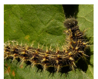
Thistle caterpillar

nubilalis), and thistle caterpillar (Vanessa cardui). These caterpillars add to a complex of defoliators in soybean fields.