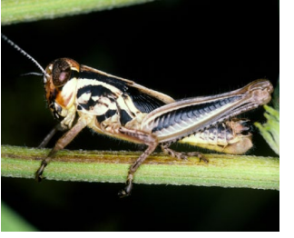
Redlegged grasshopper nymph

A number of grasshopper species can cause defoliation in soybean. Each species has a single generation per year. Both nymphs and adults should be considered when scouting. Treatment of field margins should be considered when there are \geq 20 grasshoppers per square yard. More information can be found in the NebGuide G1627, A Guide to Grasshopper Control in Cropland.