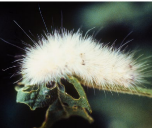
Yellow woollybear caterpillar

These are hairy caterpillars that can range in color from white to dark brown or reddish. There are two generations per year, and they are typically more abundant in drier years. Populations tend to crash due to disease.