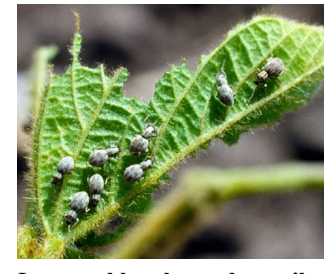
Imported longhorned weevil

They are flightless, gray-brown weevils about 1/4 inch long. As they are flightless they usually will be found in higher numbers in edges of fields. Rarely do populations reach economically damaging levels, but they do add to complexes of defoliators in soybean fields.