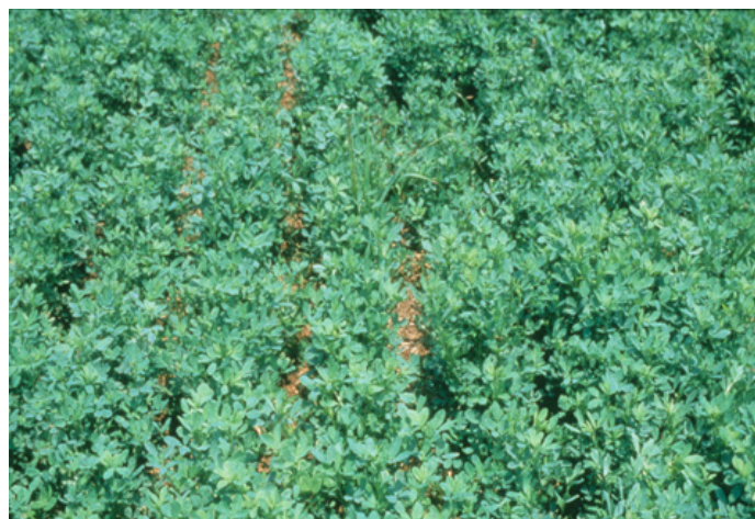
Figure 1. A dense stand of alfalfa starts with good field preparation, seed selection, and management.

When requesting recommendations, set high but realistic yield goals. Do not try to save money by reducing lime or fertilizer