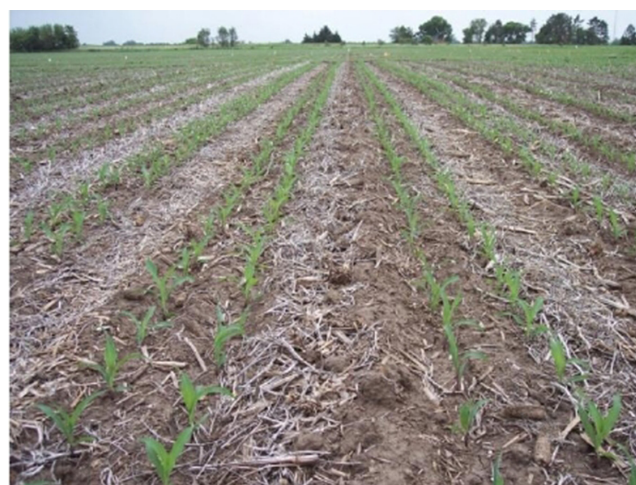
Figure 1. Twin-row planting of corn.

Selection of appropriate row spacing and seeding rate is influenced by the variable climatic conditions found in Nebraska. Mean annual precipitation ranges from 20 to 36 inches in the eastern two-thirds of the state and distribution varies seasonally. The length of the growing season as reflected by the number of growing degree days also differs across Nebraska. In general, the quantity of solar radiation from June through August is high.