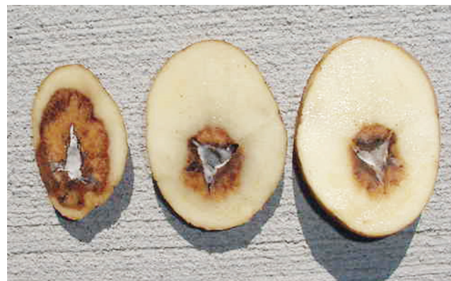
Figure 2. Bacterial soft rot (note entry portal on left)

When the bacteria enter the tuber, the cut, abrasion, or lenticel begins to discolor, decay, and even liquefy. The discoloration is creamy to tan and often outlined by a brown to black margin (Figure 2). Over time, the rot widens inside