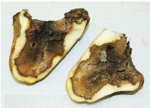
Figure 3. Pythium leak

Early symptoms of leak include very moist, gray or brown lesions around wounds. The internal tissue of infected tubers breaks down, appearing grayish and creamy. It will darken upon exposure to air ( Figure 3 ). Within a short time a vinegary smell may be evident. As the disease progresses, the tuber starts liquefying from the inside out and deep cavities often form. The skin will remain intact, a papery shell, unless ruptured (“shell rot”) as the inside hollows out. Also very noticeable is a strong stench much like rotting fish. No mold is usually seen. Leak occurs quickly, often appearing virtually overnight. Infected tubers rot rapidly, often in a few days.