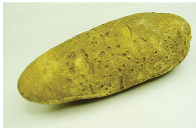
Figure 1. Swollen lenticels (cultivar Russet Norkotah)

Soft rot, the most common wet rot of potato, is caused by bacteria commonly found in soils. It also can be found on seed tubers, floating on water, carried by insects, and spread by equipment and clothes. Crops related to potato, such as tomato, and related weeds, such as the nightshades, may be infected as well.