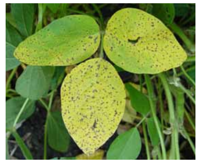
Figure 3. More advanced symptoms of brown spot on yellowing leaves prior to defoliation.

No other plant species has been found to be susceptible to the brown spot fungus under field conditions.