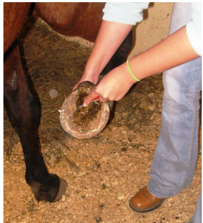
Figure 2. Hooves should be cleaned daily.

Horse's hooves should be cleaned before and after every ride (Figure 2). Depending on the type of riding, where ridden, surface ridden, and overall hoof condition, shoes may be necessary. Most horses need to have their hooves trimmed, or shoes reset every six to eight weeks, even in winter. Never turn horses out on pasture for extended periods with shoes on, unless you routinely inspect them. A loose shoe can severely injure a horse.