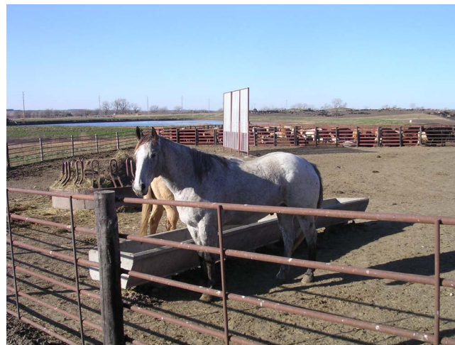
Figure 1. Horses can be maintained in dry lots.

What facilities and land does a horse need? Horses need shelter and an exercise area. A typical box stall is usually 10 feet by 12 feet, or 100 to 144 square feet. The minimum exercise area should be 50 feet by 100 feet or 5,000 square feet (about one-eighth acre), but 100 feet by 200 feet or 20,000 square feet (about one-half acre) is better. So, a horse requires one-fourth to one-half acre without pasture. With pasture, one needs about one and