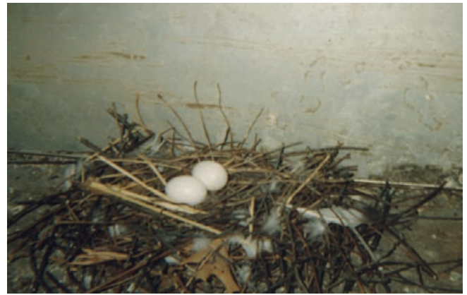
Figure 4. Pigeon nest with two eggs.

Since all three species are active during daylight, their presence is often noticeable. Telltail signs include nests, noise,