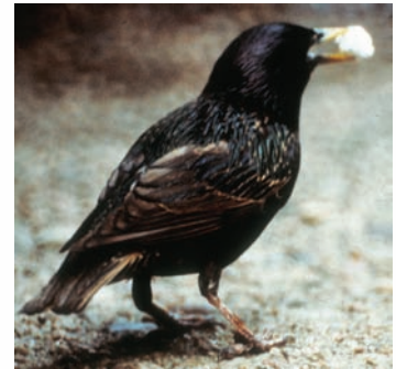
Figure 2. Starling with a piece of popcorn.

Starlings are robin-sized, short-tailed black birds about 8 inches long and weigh about 3 ounces. Plumage color changes with gender and season ( Figure 2 ). Female starlings typically have less color and have more cream on the tips of their feathers. From November to April the beak on the starling changes from brown to lighter shades of brown until the summer months when it turns to a light brownish yellow. Both the male and the female have pinkish red color on their legs. Starling calls can be quite diverse since they can mimic the sounds of other birds. They prefer to construct nests in cavities. Females lay four to six eggs in each of the year’s two clutches. Other native black birds inhabit Nebraska (e.g., red-winged blackbird, yellow-headed blackbird) and all are beneficial.