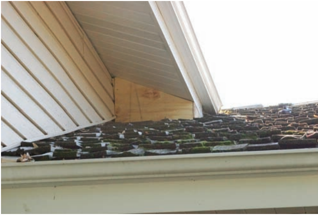
Figure 5. Enclose crevice areas under dormers to reduce the suitability of the site for nesting birds.

of damage, and concerns about aesthetics and costs. Consult http://icwdm.org for more detailed information.