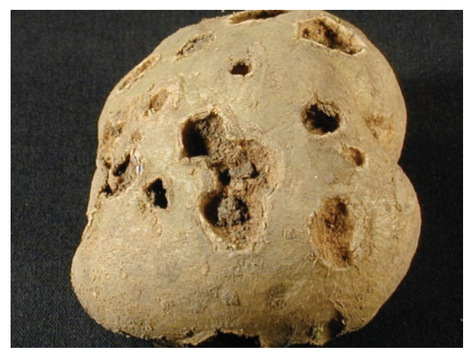
Figure 2. Potato tuber exhibiting the "pitted scab" lesion caused by common scab infection.

not visible. In scab-prone varieties, infected cells die and the observed scab is the result of a healing process. The pathogen also secretes a compound that promotes rapid cell division in the living cells surrounding the lesion. This causes the tuber cells to produce several layers of cork cells which isolate the pathogen from surrounding tuber cells. As the tuber cells die above these cork cells, the pathogen continues to feed on the dead tuber cells. This causes the cork cells to be pushed out and sloughed off. The pathogen continues to grow and feed on the additional dead cells which results in the development of the scab lesion. Lesion size varies depending on the timing of initial infection and the genetic susceptibility of the variety. Typically, the earlier a tuber is infected, the larger the lesion will be. The lesion does not develop further after the potatoes are dug, but the organism can be present and remain alive in storage.