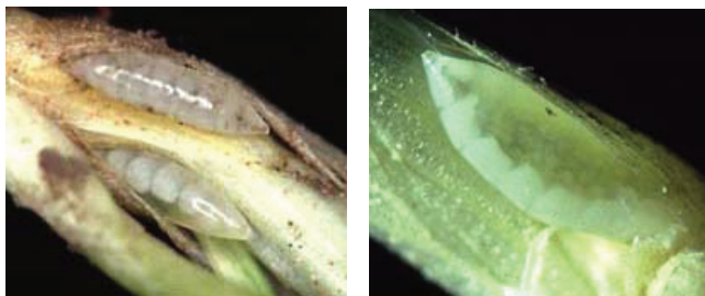
Figure 3. Hessian fly larval stages.