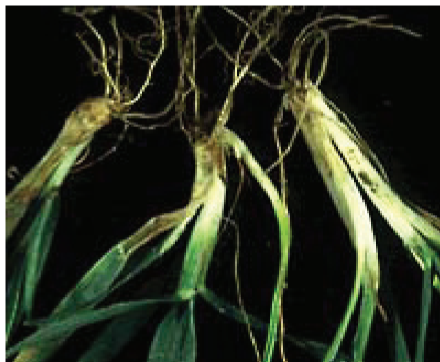
Figure 5. Wheat damaged by Hessian fly.

Plants attacked in the spring have shortened and weakened stems that may eventually break just above the first or second node, causing plants to lodge near harvest. Heavily infested fields will have reduced yields and lower-quality grain caused by adverse physiological effects (reduced plant growth and kernel size and number) and mechanical damage (breakage due to weakening of stems).