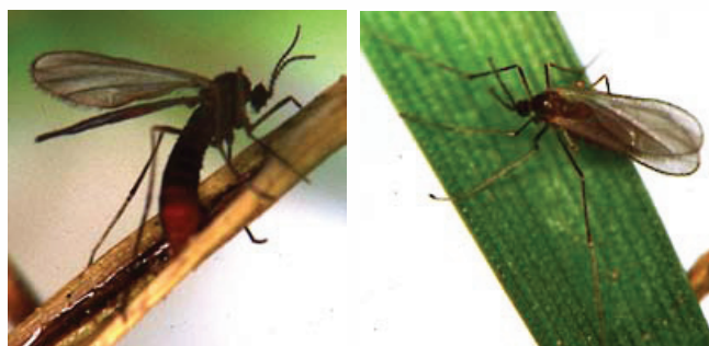
Figure 1. Adult Hessian flies.

Adult Hessian flies are about 1/8 inch long and resemble small mosquitoes ( Figure 1 ). They are smoky gray, fragile, and