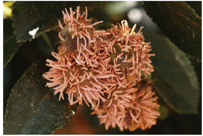
Figure 2. Cedar-Hawthorn rust producing aecia on hawthorn fruit.

Although infection sites are superficial, their presence may reduce fruit quality by causing a decrease in size, distortion or premature abortion from the tree.