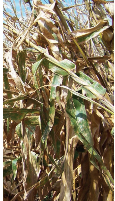
Figure 5. Blighting of leaves and entire plants due to severe gray leaf spot pressure.