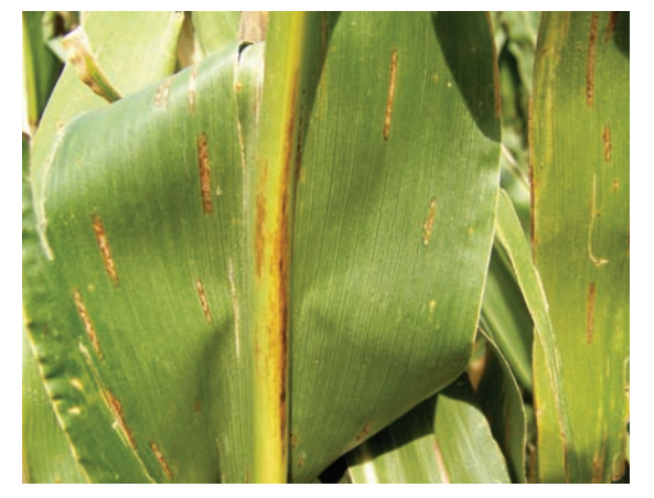
Figure 4. Mature gray leaf spot lesions are brown, rectangular-shaped, and vein-limited.