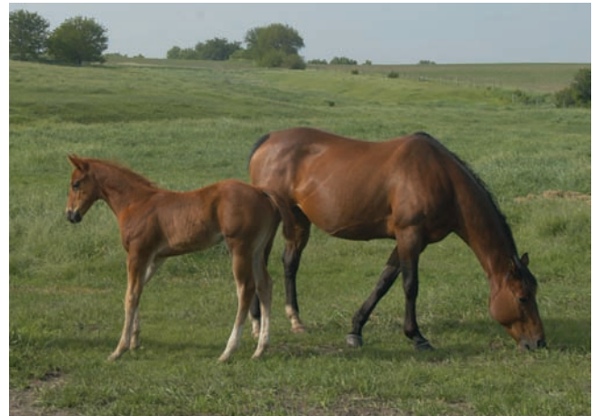
Figure 1. Foal and mare.

Various traits can influence a mare’s pregnancy length. Studies have shown colts tend to gestate 2 to 7 days longer than fillies. The nutritional plane of a mare also influences gestation length. Thin mares (condition score of 4 or below) tend to have a slightly longer gestation length than mares in a more optimal body condition (condition score of 5 to 8). Additionally, mares foaling during the late spring and summer months (long days) tend to have a shorter gestation length than those foaling in January or February. Exposing bred mares to artificially length-