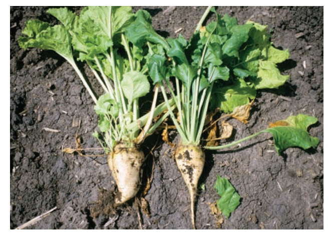
Figure 10. Blinkers — root and foliar symptoms of rhizomania (left) on a tolerant cultivar compared to uninfected plant (right). Note the yellow foliage and mass of secondary rootlets on taproot of infected plant.

This publication has been peer-reviewed.