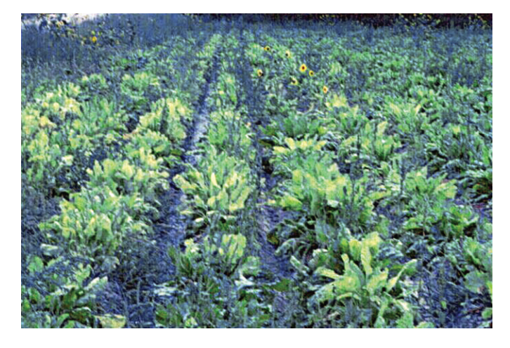
Figure 2. Yellowing and erect growth of plants affected by rhizomania in the field.