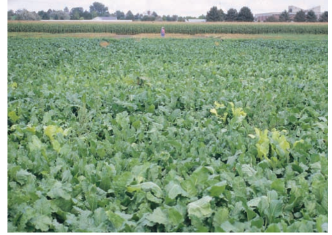
Figure 9. Blinkers — foliar symptoms (bright, fluorescent yellow upright growth) of rhizomania in the field occurring in a tolerant cultivar.