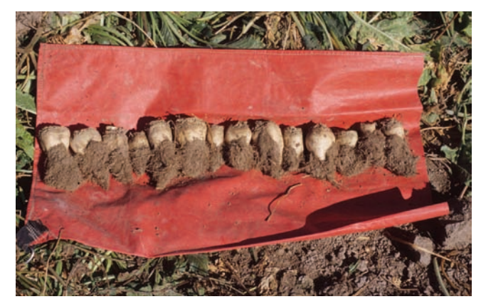
Figure 5. Bearding symptoms with very reduced taproot size, characteristic of early root infections. Source of the disease name "rhizomania" (root madness).

in soil or root debris ( Figure 7 ) as thick-walled, long-lived structures called cystosori. The presence of the vector can be readily confirmed by observing the thick-walled cystosori within roots in wet mounts under the microscope ( Figure 8 ). Under conditions of high soil moisture and warm temperatures, the cystosori liberate viruliferous zoospores that inject the virus into plants as they infect roots. Without the vector, the viral disease does not occur. Beet necrotic yellow vein virus has a restricted host range which includes members of the families Chenopodiaceae , Aizoaceae , and Amaranthaceae . The virus can also be mechanically transmitted.