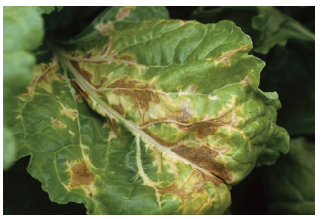
Figure 4. Vein banding symptoms becoming necrotic – source of virus name (beet necrotic yellow vein virus or BNYVV).

Using of resistant cultivars is the most effective and least expensive tool for managing this disease. Unfortunately, some recent evidence suggests that some populations