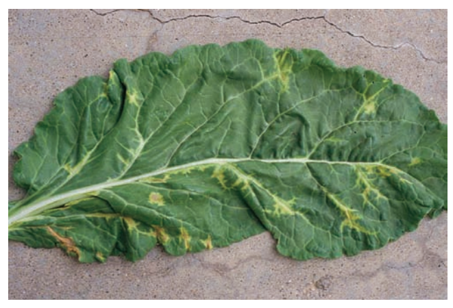
Figure 3. Yellow veinbanding symptoms characteristic of systemic rhizomania infection.