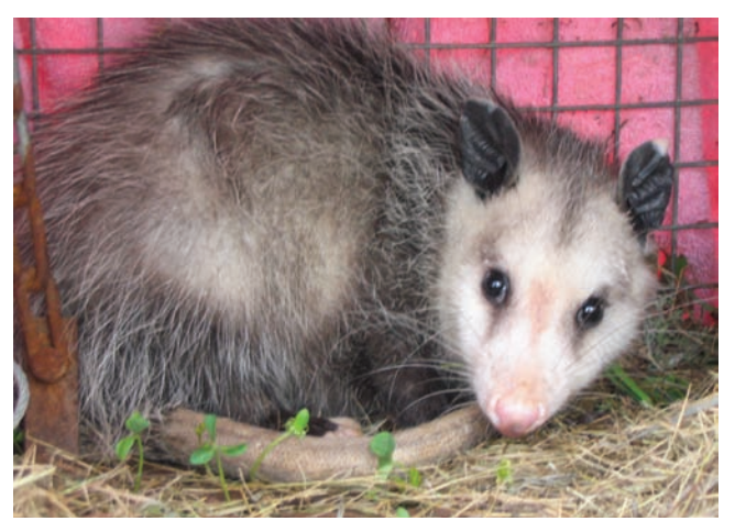
Figure 1. Cage trapped opossum.

University of Nebraska–Lincoln Extension provides a wide range of information on managing wildlife damage. NebGuides on the most common wildlife problems confronting Nebraskans are available at local extension offices or online at <a href="http://ianrpubs.unl.edu/wildlife">http://ianrpubs.unl.edu/wildlife</a>. For species and situations not addressed by NebGuides, landowners should consult the book "Prevention and Control of Wildlife Damage," available through your extension educator or online at <a href="http://icwdm.org/handbook/index.asp">http://icwdm.org/handbook/index.asp</a>. The Internet Center for Wildlife Damage Management (<a href="http://icwdm.org">http://icwdm.org</a>) provides other information useful for property owners wanting to mitigate wildlife damage, including tips on identification of damage, additional how-to instructions, Ask the Expert and prevention information.