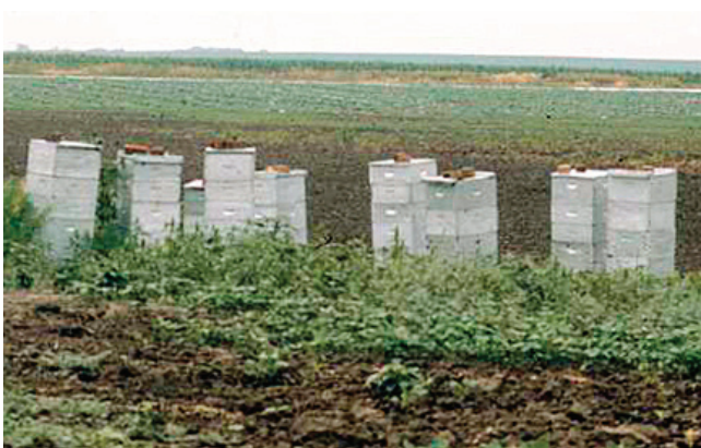
Figure 3. Honeybee colonies should be left in cucumber fields until just before the last picking.

Honeybee colonies should be moved into position near the field about the time the first female flowers are seen ( Figure 2 ). If the bees are moved in too early, they may find other attractive flowering plants in the area and not work the cucurbits. Hives can be removed from melon fields when flowering begins to diminish or when the vines begin to break down. Leave colonies in cucumber fields until a day or so before the last picking ( Figure 3 ).