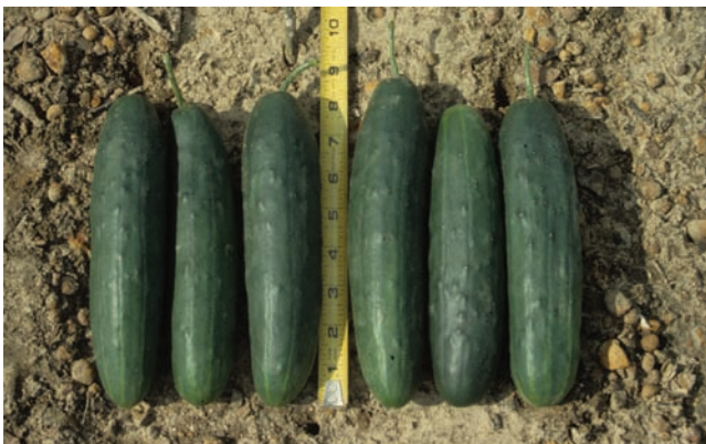
Figure 1. Good pollination will produce better yield and quality.

Researchers have found that it takes at least nine honeybee visits per flower to pollinate cucumbers adequately. Since each bee will visit about 100 flowers per foraging trip, usually