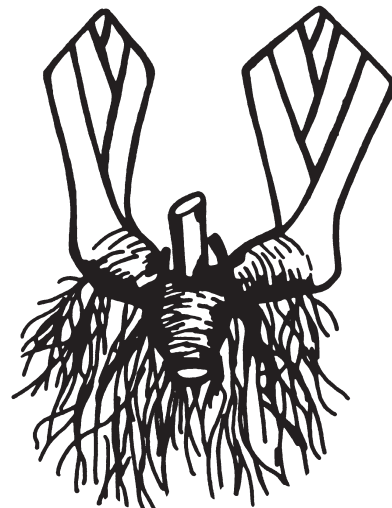
Figure 4. Small iris clump showing proper division for replanting. The central portion should be discarded. The two-side "fans" can be replanted for bloom next year.

After the snow and ice have melted away in the spring, remove the mulch. Do this in several stages. Remove the