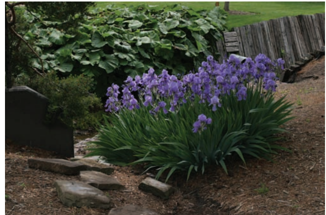
Figure 1. Irises

A properly located and prepared soil bed will result in better iris growth and more blooms. Irises perform best in full sun — a minimum of six hours per day. Light afternoon shade will help prevent the fading of flower colors. Irises prefer well-drained soils with a pH between 6.0-7.5. Poorly drained soils may lead to unsatisfactory performance due to diseases. Before planting, work the area where the iris bed is to be planted to a depth of at least 10 inches. One to two inches of compost can be incorporated to a depth of 10 inches into poorly drained soils to improve water drainage. In very poorly drained soils, irises can be planted in raised beds. A general fertilization with 2 pounds of 5-10-10 per 100 square feet is recommended. Prepare the soil two to three weeks before planting to allow settling.