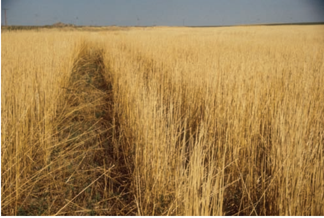
Figure 3. This wheat field south of Sidney, Neb., was harvested with a Shelborne Reynolds Combine Stripper Header. The use of a stripper header for wheat harvest can leave a tall wheat stubble that provides excellent protection against wind erosion. Additionally, a taller stubble has been found to decrease soil water loss through evaporation, reduce weed infestations, and catch and retain more wind-driven snow in fields where the extra moisture can significantly increase the yield of the following crop.

Another means of increasing silhouette area is to increase the number of stalks in a given area. Be careful not to increase plant density too much or crop performance may suffer. For example, planting rainfed sunflower at too high a population for a given site may result in weakened stalks that break more easily, resulting in a shorter stalk height and reduced silhouette area. Despite their smaller stalk diameter, small grains usually do a better job of reducing wind erosion than crops like corn or sunflower because they have many more stalks per given area ( Table II ).