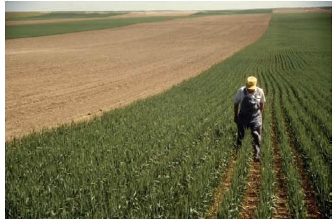
Figure 4. Stripcropping is a common practice in the Nebraska Panhandle to reduce wind erosion and winter-kill problems. Soil type is one factor that determines the width of the strips. Strips should be arranged perpendicular to the prevailing wind direction.

Irrigated crops like sugarbeet and dry bean leave little residue cover. A cover crop such as winter wheat or winter rye may be planted after dry bean to provide soil cover, but the crop must be planted early enough (by mid-September) to allow sufficient establishment of the cover crop to prevent soil blowing during the winter and early spring. To increase the odds of success with a fall cover crop, growers may want to consider planting a short season dry bean variety in late May to help assure an early harvest. Irrigation before planting the cover crop should be considered if soil conditions are extremely dry in order to ensure consistent and uniform seeding depth and rapid crop emergence. The cover crop rows should be planted perpendicular to the prevailing wind direction, which is usually from the northwest. If using a disk drill, row spacings should be narrow (6 to 8 inches). Wider row spacings are acceptable if a hoe drill is used and ridges are formed. If crops are harvested too late in the season to allow for adequate establishment of a cover crop, producers should consider increasing surface roughness with tillage or by applying manure or crop residues.