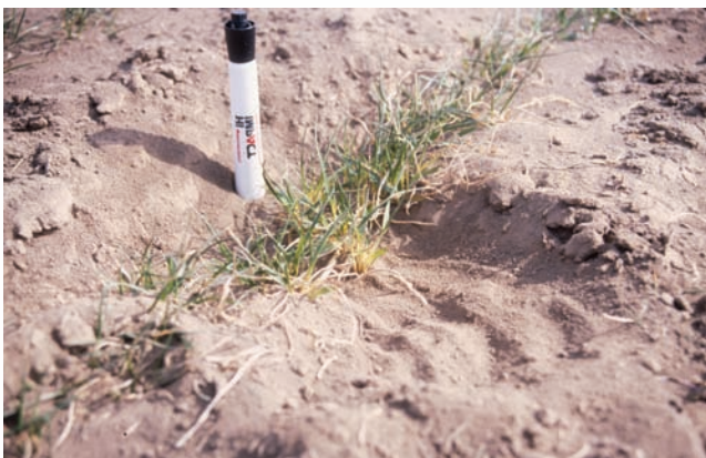
Figure 1. Blowing soil fills seed furrows and partially buries small wheat plants in the spring, resulting in increased plant stress that weakens the plants and makes them more susceptible to further damage by disease and other environmental stresses.

A strong, turbulent wind, coupled with highly erodible field conditions, causes wind erosion. A wind speed as low as 6 mph one foot above the soil surface is capable of starting soil movement under highly erodible field conditions. Erodible field conditions consist of an unprotected soil surface that is smooth, bare, loose, dry, and finely granulated ( Figure 1 ). If