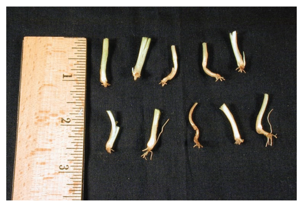
Figure 2. To determine winter survival of wheat, remove wheat plants from the field, using water to clean the soil away from the roots. Remove fall growth to within one inch of the crown and cut off roots below the crown. These ten wet crowns are placed in a labeled plastic bag that is inflated and sealed and checked every two days for new growth.