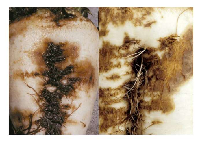
Figure 5. Root lesions of Aphanomyces root rot of sugarbeet — initial water-soaked lesions (left) and scabby lesions after drying (right) .

The chronic root rot phase occurs on plants infected earlier in the season or from new infections on older plants, and is more common than the acute phase in many production areas. Foliar symptoms consist of stunted, yellowed leaves with non-vigorous growth (Figure 3). Wilting also may occur during the day, but plants often recover at night (Figure 4). Permanent wilting is not common, in contrast with Rhizoctonia root rot. Leaves also may take on a scorched appearance and become brittle. Root symptoms begin as yellowish-brown, water-soaked lesions on taproots, (Figure 5, left) that later become dry and necrotic (scarring) if infection ceases (Figure 5, right). These lesions can occur anywhere on the taproot, but often occur toward the distal end as a tip rot (Figure 6). If disease continues to progress, the lesions penetrate into the root interior, causing a yellowish-brown discoloration of infected tissues (Figure 7). Similar to the acute phase, if environmental conditions become more favorable for plant growth, plants may recover to produce a relatively healthy crop; however, many roots may still exhibit varying degrees of root distortion and/or scarring (Figures 8 and 9), which are indicative of previous A. cochlioides infections. In severe cases, the extent of the disease can completely destroy taproots, leaving