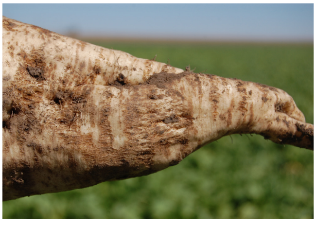
Figure 8. Mild scarring of sugarbeet due to previous A. cochlioides infection.