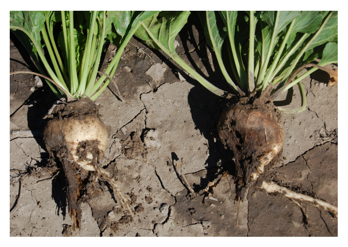
Figure 6. Early tip rot symptoms of Aphanomyces root rot of sugarbeet.

little except the crowns ( Figure 10 ), yet often still may maintain deceptively healthy looking tops. Economic loss also may occur at harvest due to this disease because beets affected to this degree are easily dislodged from soil, and roots knocked into furrows during the defoliation process are not subsequently retrieved by the harvester ( Figure 11 ).