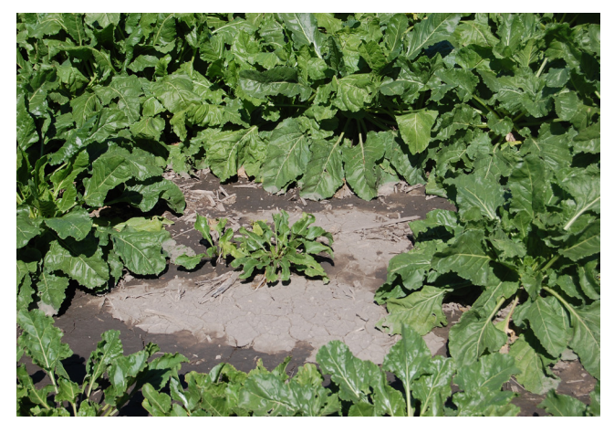
Figure 3. Foliar symptoms (yellowing and stunting) characteristic of Aphanomyces root rot.