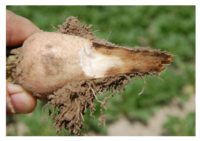
Figure 7. Internal discoloration of taproot as disease progresses from initial infection.