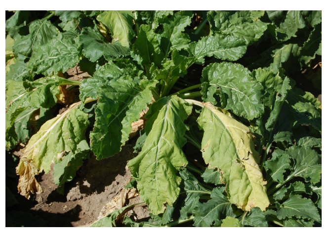
Figure 4. Foliar symptoms (yellowing and wilting) characteristic of Aphanomyces root rot.

The chronic root rot phase occurs on plants infected earlier in the season or from new infections on older plants, and is more common than the acute phase in many production areas. Foliar symptoms consist of stunted, yellowed leaves with non-vigorous growth (Figure 3). Wilting also may occur during the day, but plants often recover at night (Figure 4). Permanent wilting is not common, in contrast with Rhizoctonia root rot. Leaves also may take on a scorched appearance and become brittle. Root symptoms begin as yellowish-brown, water-soaked lesions on taproots, (Figure 5, left) that later become dry and necrotic (scarring) if infection ceases (Figure 5, right). These lesions can occur anywhere on the taproot, but often occur toward the distal end as a tip rot (Figure 6). If disease continues to progress, the lesions penetrate into the root interior, causing a yellowish-brown discoloration of infected tissues (Figure 7). Similar to the acute phase, if environmental conditions become more favorable for plant growth, plants may recover to produce a relatively healthy crop; however, many roots may still exhibit varying degrees of root distortion and/or scarring (Figures 8 and 9), which are indicative of previous A. cochlioides infections. In severe cases, the extent of the disease can completely destroy taproots, leaving