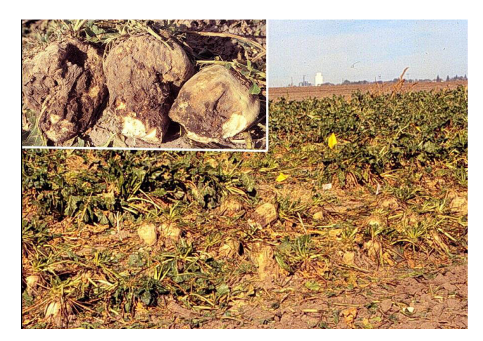
Figure 11. Aphanomyces -infested field at harvest and severely scarred and distorted roots broken off at ground level after defoliation (inset).