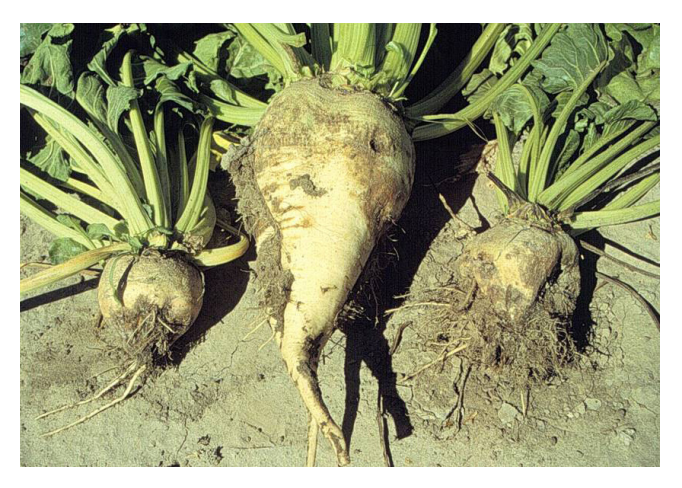
Figure 10. Severe rotting symptoms of Aphanomyces root rot of sugarbeet.