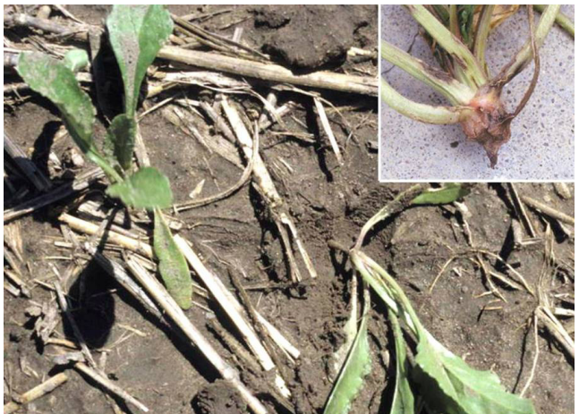
Figure 2. Young sugarbeet plant infected by A. cochlioides. Thin, delicate stems are more susceptible to breakage and stand loss from high winds (inset).