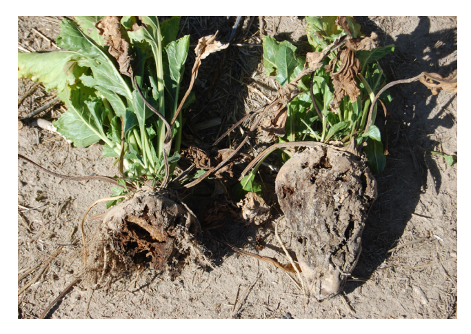
Figure 9. Severe distortion of sugarbeets due to previous A. cochlioides infection.