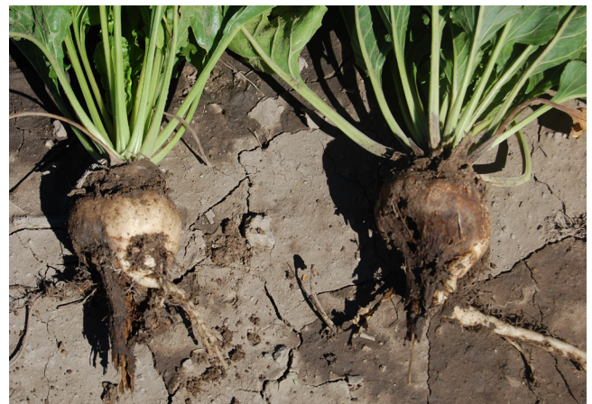
Figure 6. Early tip rot symptoms of Aphanomyces root rot of sugarbeet.

The chronic root rot phase occurs on plants infected earlier in the season or from new infections on older plants, and is more common than the acute phase in many production areas. Foliar symptoms consist of stunted, yellowed leaves with non-vigorous growth ( Figure 3 ). Wilting also may occur during the day, but plants often recover at night ( Figure 4 ). Permanent wilting is not common, in contrast with Rhizoctonia root rot. Leaves also may take on a scorched appearance and become brittle. Root symptoms begin as yellowish-brown, water-soaked lesions on taproots, ( Figure 5, left ) that later become dry and necrotic (scarring) if infection ceases ( Figure 5, right ). These lesions can occur anywhere on the taproot, but often occur toward the distal end as a tip rot ( Figure 6 ). If disease continues to progress, the lesions penetrate into the root interior, causing a yellowish-brown discoloration of infected tissues ( Figure 7 ). Similar to the acute phase, if environmental conditions become more favorable for plant growth, plants may recover to produce a relatively healthy crop; however, many roots may still exhibit varying degrees of root distortion and/or scarring ( Figures 8 and 9 ), which are indicative of previous A. cochlioides infections. In severe cases, the extent of the disease can completely destroy taproots, leaving