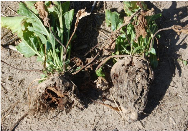
Figure 9. Severe distortion of sugarbeets due to previous A. cochlioides infection.