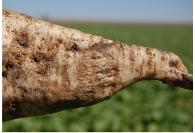
Figure 8. Mild scarring of sugarbeet due to previous A. cochlioides infection.