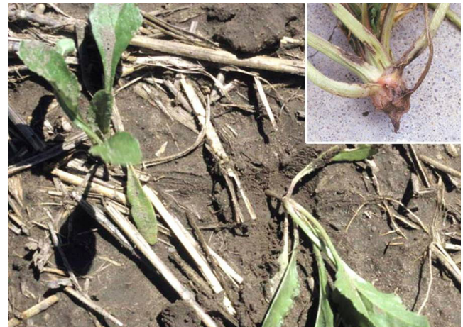
Figure 2. Young sugarbeet plant infected by A. cochlioides . Thin, delicate stems are more susceptible to breakage and stand loss from high winds (inset).