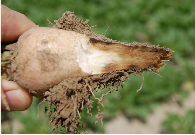
Figure 7. Internal discoloration of taproot as disease progresses from initial infection.