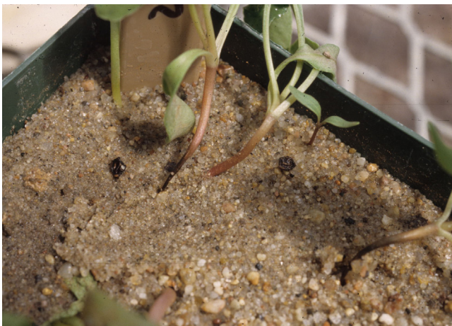
Figure 1. Black, thin stems and lack of cotyledon wilting, characteristic of acute seedling phase of the disease caused by A. cochlioides . Note the pink-colored stem of healthy plant.

If conditions become unfavorable for further disease development, plants may recover and still produce a relatively normal crop. Severely affected plants from black root have very delicate, thin stems, and are often more susceptible to breakage from high winds in the spring ( Figure 2 ).