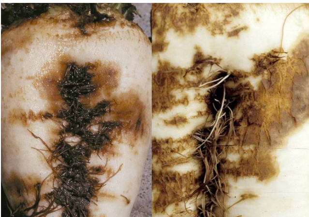
Figure 5. Root lesions of Aphanomyces root rot of sugarbeet — initial water-soaked lesions ( left ) and scabby lesions after drying ( right ).