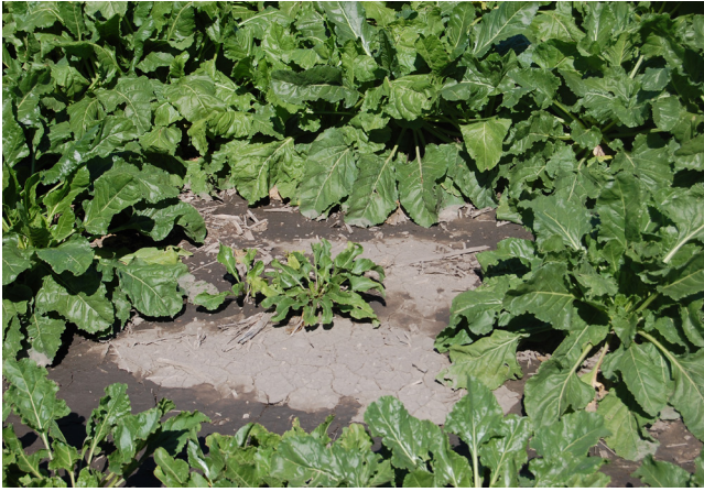
Figure 3. Foliar symptoms (yellowing and stunting) characteristic of Aphanomyces root rot.