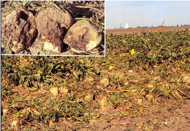
Figure 11. Aphanomyces -infested field at harvest and severely scarred and distorted roots broken off at ground level after defoliation (inset).