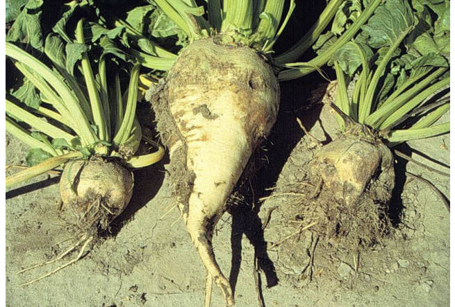
Figure 10. Severe rotting symptoms of Aphanomyces root rot of sugarbeet.