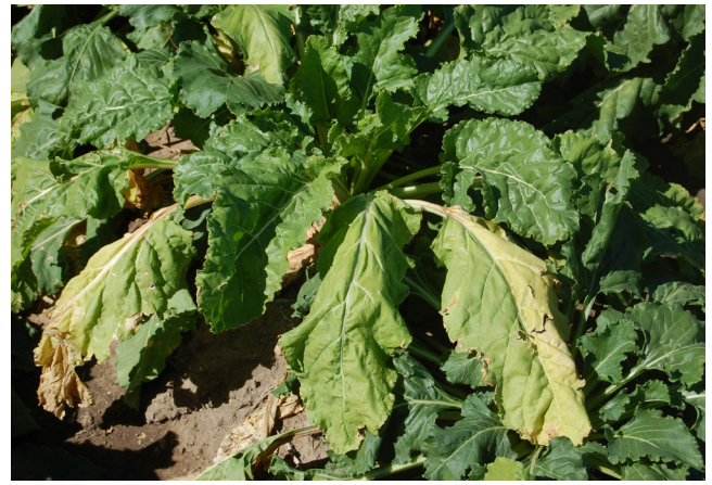
Figure 4. Foliar symptoms (yellowing and wilting) characteristic of Aphanomyces root rot.