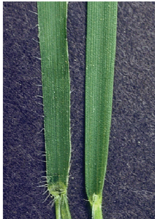
Figure 2. Hairs extend from the margin of the leaf blade of jointed goatgrass (left), particularly near the collar or stem, distinguishing it from winter wheat (right), which is hairless.