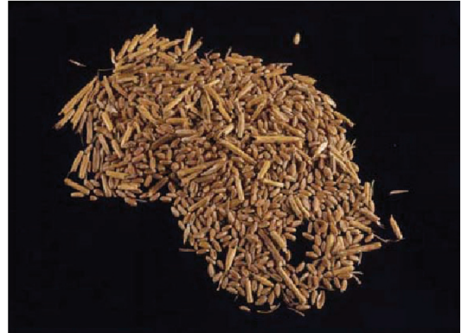
Figure 5. Winter wheat grain contaminated with jointed goatgrass spikelets (joints).