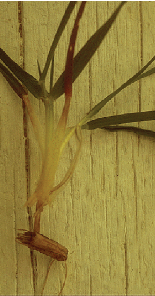
Figure 3. An effective method of distinguishing between vegetative jointed goatgrass and wheat is to dig up the plant and look for the spikelet (joint) attached to the root of jointed goatgrass.

Jointed goatgrass reduces winter wheat yields by competing for moisture, light, space and nutrients. At Akron, Colo., winter wheat yields declined by 28 percent when jointed goatgrass at a density of 15 plants per square yard emerged with wheat in the fall. When it emerged at the same density in early spring, wheat yields declined by 8 percent. At North Platte, winter wheat yields declined by 0.4 percent for every jointed goatgrass plant per square yard that emerged in the fall.