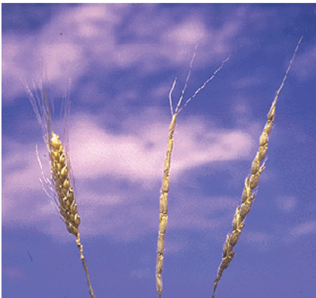
Figure 1. Winter wheat (left) and jointed goatgrass (center) occasionally cross to produce a hybrid (right) that is intermediate in form.

During combine harvesting, spikelets shatter and contaminate harvested winter wheat grain ( Figure 5 ), which then may be discounted. Discounts average 3 to 6 cents per bushel, but can be as high as $1 per bushel. Some elevators will not buy wheat heavily infested with jointed goatgrass spikelets. Spikelets not removed by grain cleaning are considered foreign matter and can reduce grain grade and/or test weight.