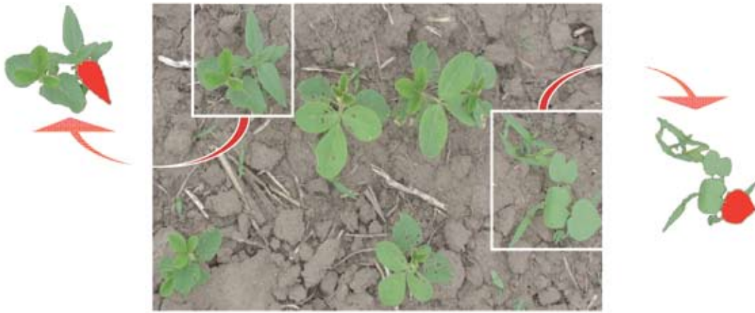
Figure 5. Using machine vision to recognize different plant species grown in a field.

winter annual weed maps, saving considerable time over in-season scouting. Henbit ( Lamium amplexicaule ) can be effectively detected with aerial photography since it has a low growth habit and occurs in dense patches.