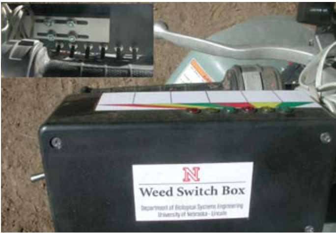
Figure 1. Weed Switch Box mounted to the handle bar of an ATV.