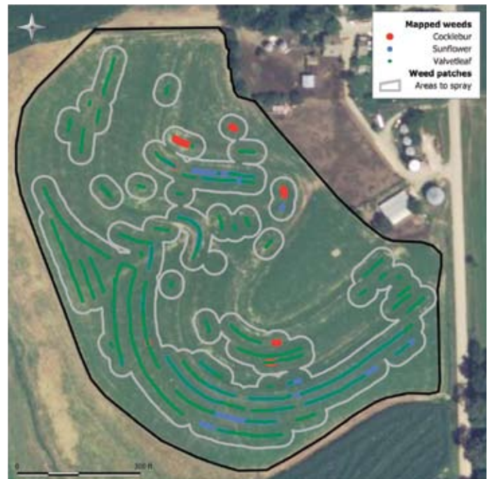
Figure 2. Results of weed mapping using the Weed Switch Box.

Corn grain yield was mapped to see if yield was affected by the herbicide treatments. There was no significant difference in