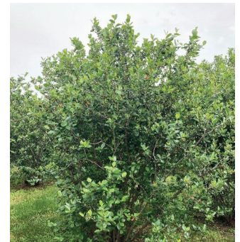
Figure 2. Mature black chokeberry at Native 32 Winery

August. Its growth originates from the crown, and it does not sucker aggressively, which many homeowners may appreciate. There are both landscaping and fruit production cultivars available, but all Aronia have shiny dark green leaves, white umbels of flowers, and bright red fall foliage, plus it has good resistance to pests and diseases compared to many other fruit-bearing species (Wiederholt, 2007). Black chokeberries are smaller than red chokeberries, with an average height ranging from 4 to 8 feet (Figure 2). Black chokeberry flowers are late enough in the spring to avoid spring frost damage to its flowers. Some black chokeberries have larger fruit with a less bitter, more flavorful taste. Once ripe, berries can be harvested, or left on the shrub for wildlife and winter interest. If not first eaten by birds and other wildlife, the berries will eventually drop off. This species can be found throughout its native range in the Northeast and Midwest, as well as eastern Canada, in both damp/wet and dry soils. Among the cultivars of black