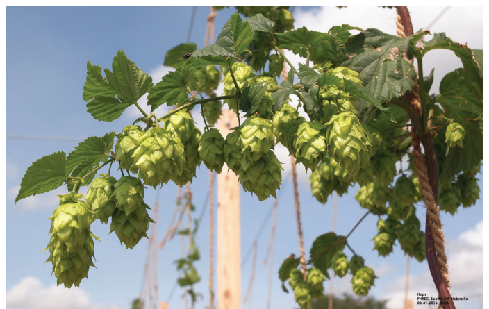
Figure 6. Cones are ready to harvest when the dry weight accumulation of the cones is approximately 20 percent. Harvest date is dependent upon variety but will generally be late August through mid-September.