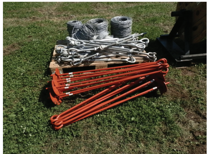
Figure 2. Quality trellis supplies will provide a long-lasting hop trellis system.

Farmers are seeking ways to improve farm income through the production of high-value specialty crops. Hop