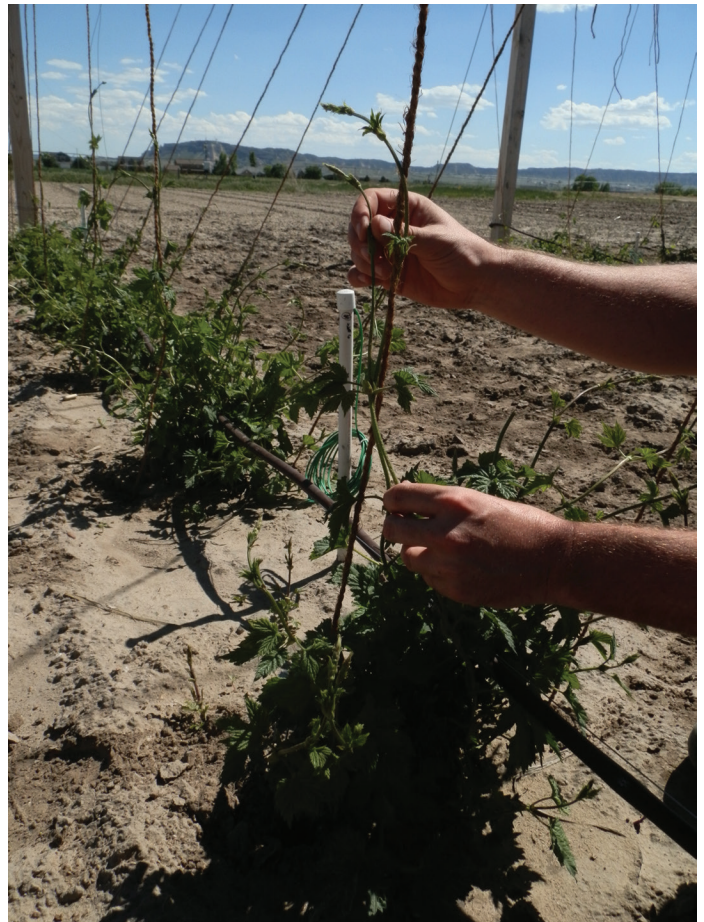
Figure 5. Hop plants are trained using two or three shoots that are 18–24 inches long and gently wrapping them approximately two times around the coir rope without injuring the growth tip.