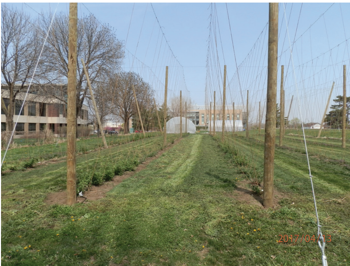
Figure 1. Quarter-acre hop trellising with “V” style training of hop plants.