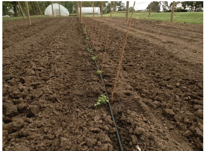
Figure 4. Short and frequent irrigation cycles and weed management are important in the new hop field planting.

Hop can be grown in a wide range of soil types; however, locations that are well-drained are necessary for best production. Sites previously cultivated can easily have the planting beds marked out and then tilled after the trellis system has been installed. Topography should be considered for ease of trellis installation, plant cultivation, and harvest activities, given that level sites allow for greatest efficiency in all production activities. Trellising systems should typically be oriented in a north-south direction to optimize light infiltration into the plant canopy.