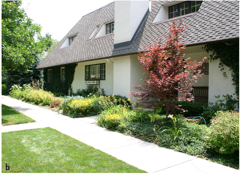
Figures 2a-b. Trees with unique bark, striking fall color, colored foliage, or an interesting shape can focus attention to specific landscape locations