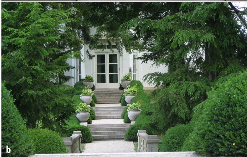
Figures 3a-b. Trees that are repeated throughout a landscape help unify the character of the entire landscape