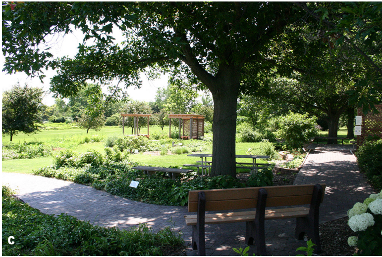
Figures 4a-c. A tree canopy can strongly define a high (a), low (b), or moderate (c) ceiling height for outdoor landscape rooms