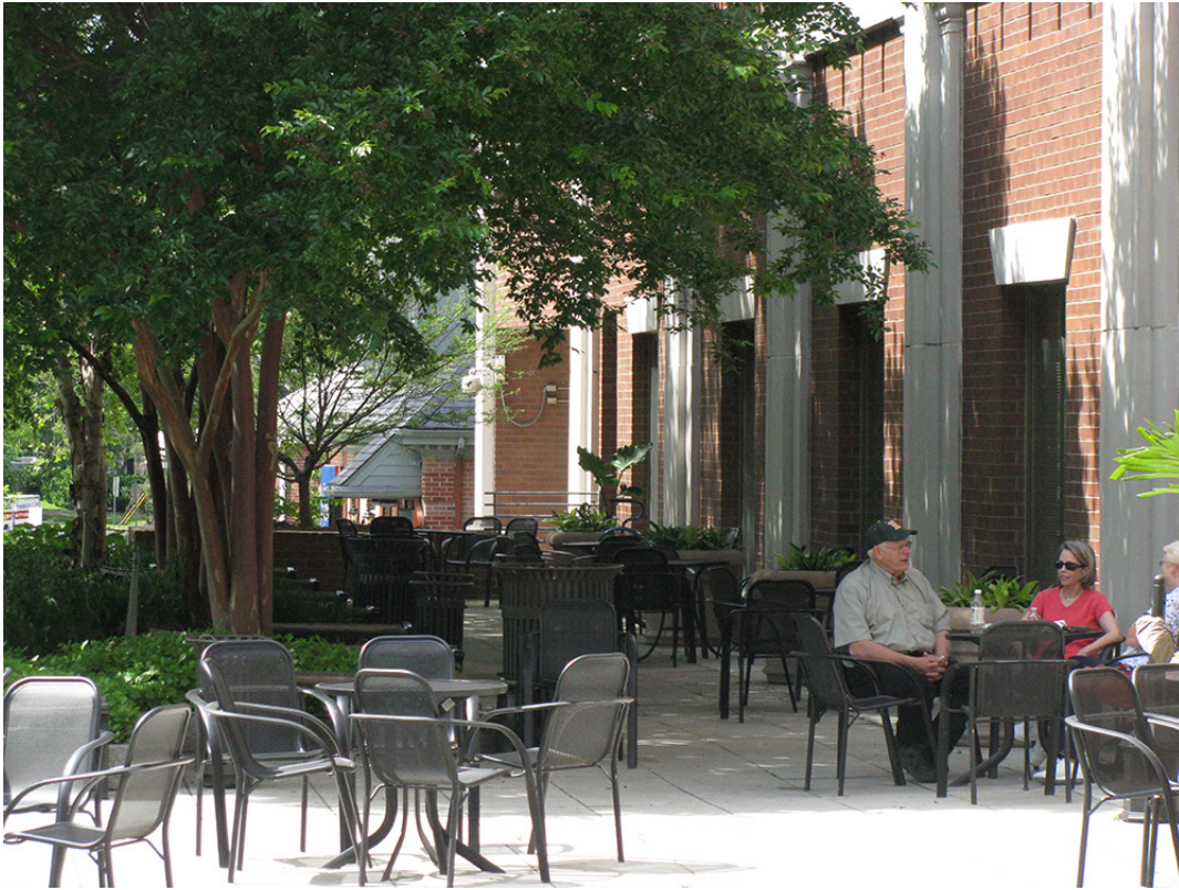
Figure 6. Trees can shade buildings and paved surfaces, reducing summer cooling costs and the “heat island” effect of increased temperatures in urban areas