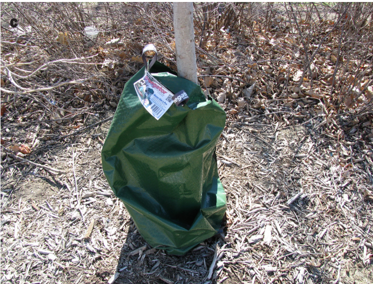
Figures 9a-c. Soaker hoses, drip irrigation systems, and various “bag” products are available to water trees slowly over time while minimizing water loss and saving time