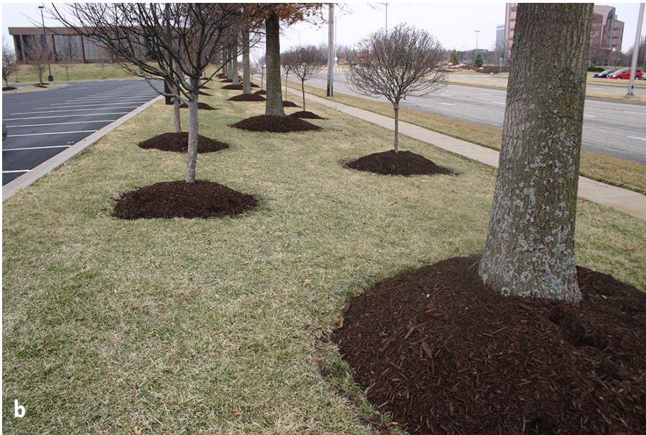
Figure 10a. Organic materials decompose over time, recycling nutrients back to the tree and incorporating humus into the soil profile to support healthy rooting systems. Figure 10b. Improper mulching – mulch should never be piled up against a tree trunk in a mound; moisture and insect damage to the bark can result. In addition, few, if any, roots benefit from the mulch layer when it does not extend out to or beyond the drip line of the tree.

Observe and document visual symptoms in trees such as a reduced growth rate in current and previous years and color changes in leaves ( Figure 11 ). If necessary, perform a soil test to determine the level of essential nutrients and soil pH. Additionally, core aerate and surface apply nutrients as indicated by a soil test.