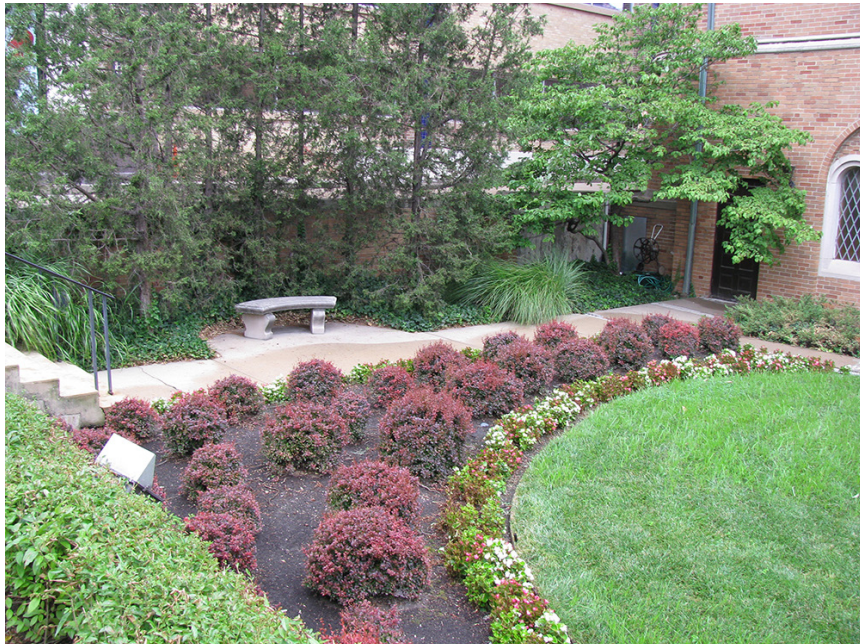
Figure 5. Evergreen trees can provide screening for privacy, wind protection, or enhanced definition of space