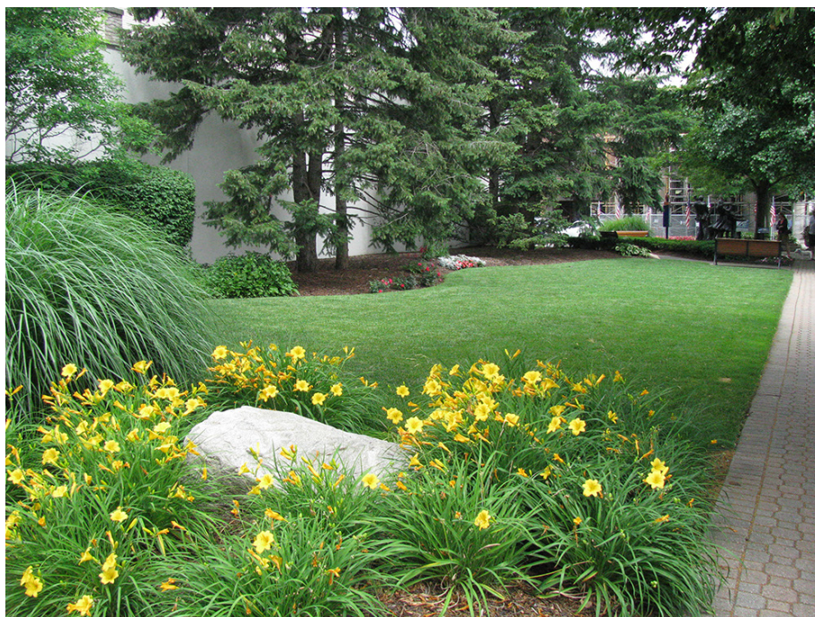
Figure 7. Ornamental or enframing trees can often be placed in landscape beds near building corners or landscape perimeters to avoid mowing/chemical conflicts and take advantage of the benefits of mulched rooting areas

Finding the “right place” for a tree includes an understanding of the site conditions, including the number of hours of direct sun received; soil texture (is the soil sandy, which drains quickly, or clayey, which drains slowly?); soil structure (has