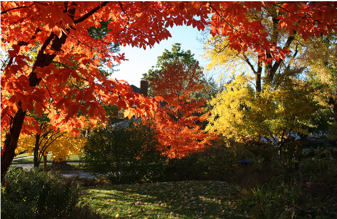
Figure 12. If trees are properly selected for suitable locations, planted and managed with recommended water-wise methods that maximize soil moisture availability, tree rooting, and vigor, healthy trees can retain their important roles in urban and rural landscapes across the state

This publication has been peer reviewed.