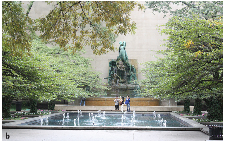
Figures 1a-b. Trees soften building corners and rooflines, focus views, and help visually connect buildings to adjacent landscapes