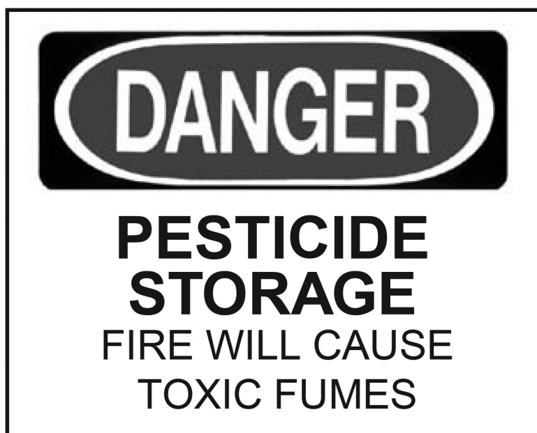
Danger! Pesticide storage sign.

Wooden pallets or metal shelves must be provided for storing granular and dry formulations packaged in sacks, fiber drums, boxes, or other water-permeable containers. If metal pesticide containers are stored for a prolonged period, they should be placed on pallets, rather than directly on the floor, to help reduce potential corrosion and leakage.