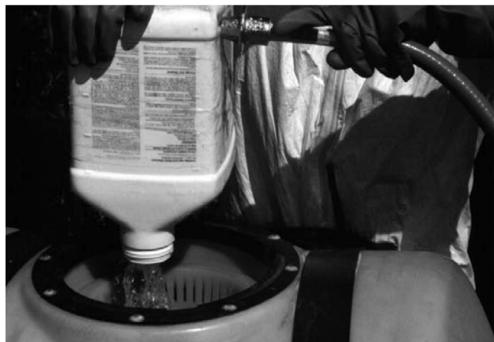
Pressure-rinsing a pesticide container.

Two commonly used procedures are effective for properly rinsing nonrefillable liquid pesticide containers: pressure-rinsing and triple-rinsing.