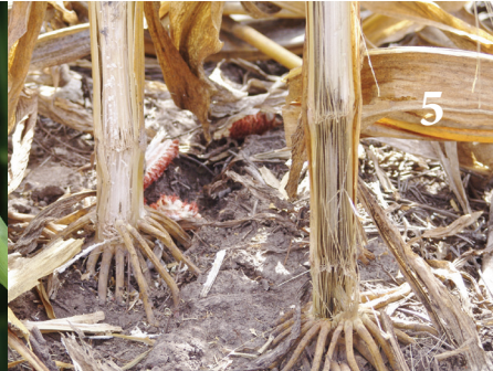
Fig. 5. Charcoal Rot