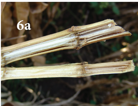
Fig. 6a. (above) Stalk Rot Fig. 6b. (right) Crown Rot