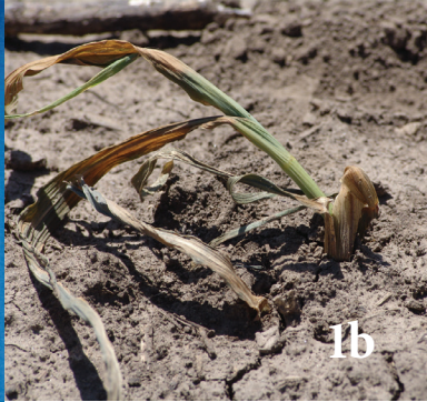
Fig. 1a. (left) Rotting Roots Fig. 1b. (above) Damping Off