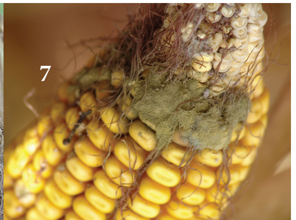
Fig. 7. Aspergillus Ear Rot