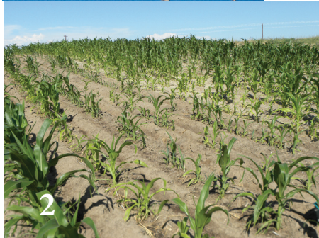
Fig. 2. Nematodes