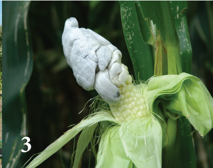
Fig. 3. Common Smut