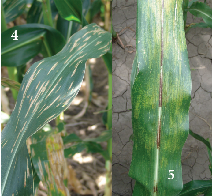
Fig. 4. Leaf Spot Fig. 5. Physoderma Brown Spot