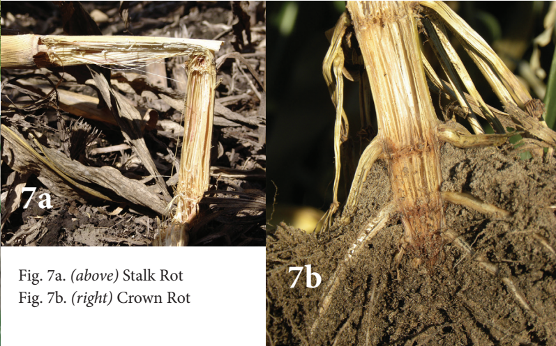
Fig. 7a. (above) Stalk Rot Fig. 7b. (right) Crown Rot