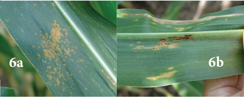
Fig. 6a. Southern Rust Fig. 6b. Common Rust