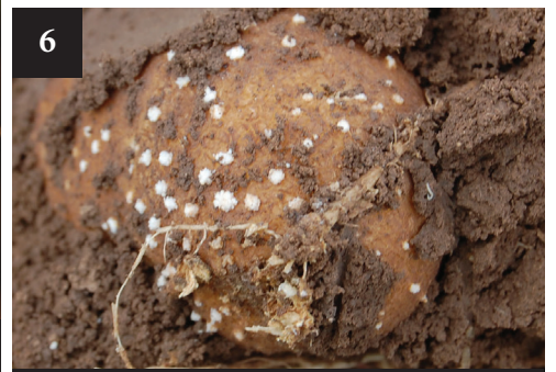
6. Enlarged lenticels on tubers