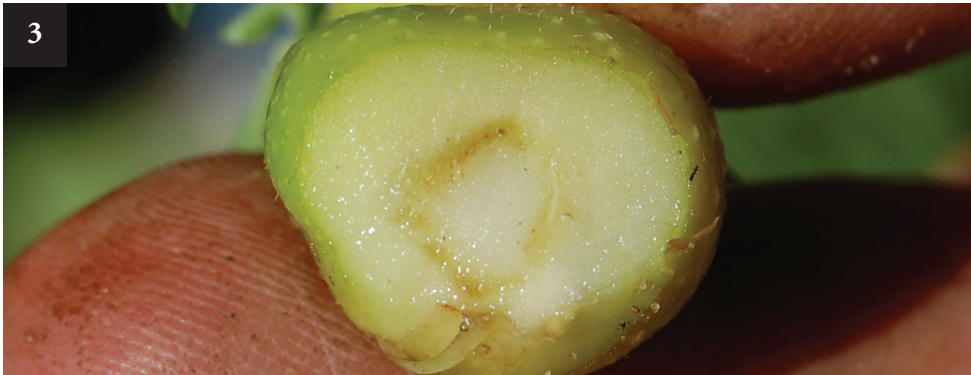
3. Discoloration in the vascular ring of a young, immature tuber