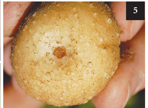
5. Pinkish-purple color of "belly button"