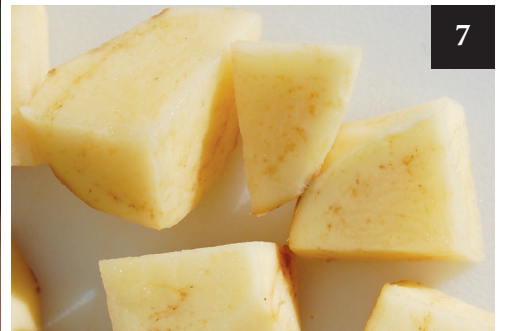
7. Vascular discoloration in tubers