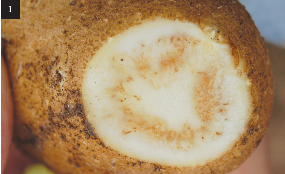
1. Vascular discoloration of infected tubers — necrosis of vascular rings