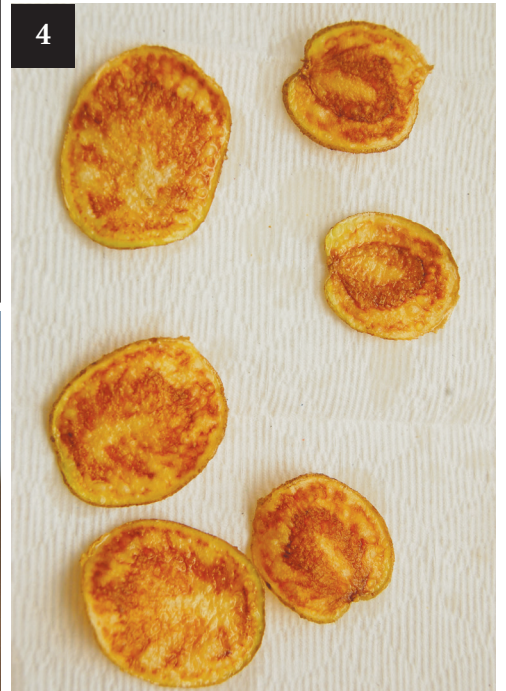
4. Diagnostic symptoms of Zebra Chip