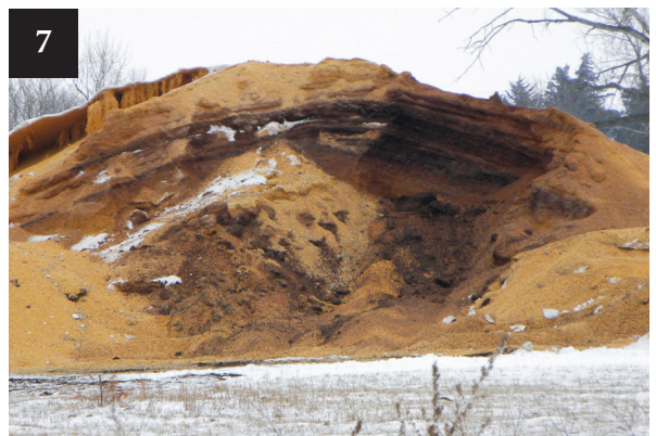
7. Moldy Outdoor Storage Pile