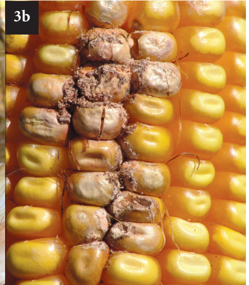
3. Fusarium Ear Rot