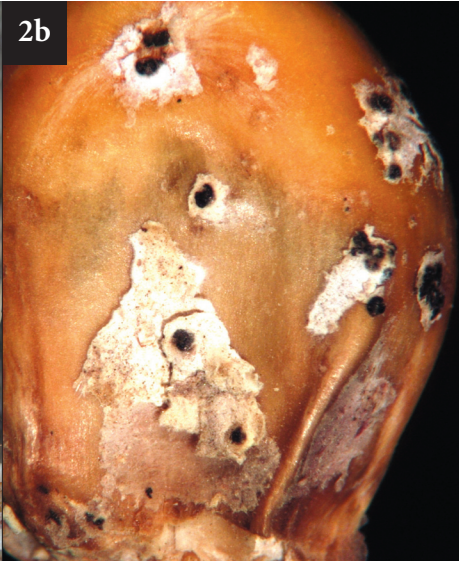
2. Diplodia Ear Rot