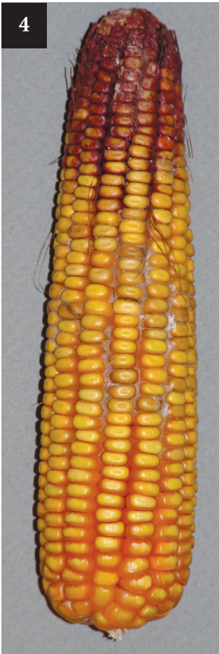
4. Gibberella Ear Rot