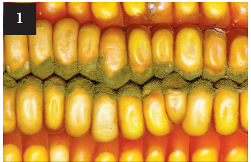
1. Aspergillus Ear Rot