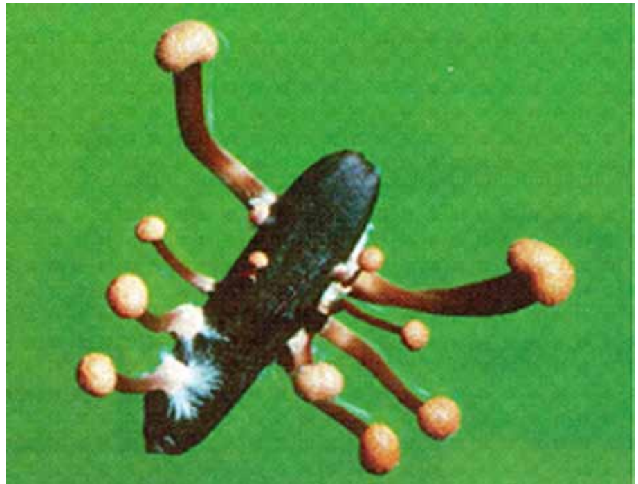
Figure 3. An ergot sclerotium that has germinated to produce stromata that will produce sexual spores (ascospores).

C. purpurea produces two types of spores. Sexual spores known as ascospores are produced in stromata (singular: stroma; compact masses of specialized vegetative hyphae) formed when sclerotia germinate. During germination, each sclerotium forms 1-60 stromata. Each stroma consists of a flesh-colored stalk 0.5-2.5 centimeters (0.2-1.0 inch) tall, the tip of which produces a spherical head (Figure 3). Numerous sexual fruiting structures known as perithecia (singular: perithecium) develop at the periphery of each head. Each perithecium contains many sac-like cells known as asci (singular: ascus). Meiosis (cell division) results in eight long, multicellular ascospores in each ascus. Asexual spores known as conidia are produced following infection of host plant ovaries by ascospores. Both types of spores are spread by wind, splashing rain, or insects.