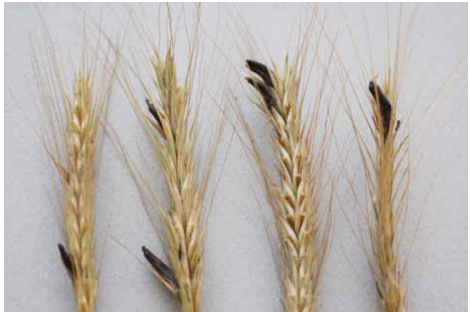
Figure 1. Ergot sclerotia protruding from rye heads.

Ergot is a fungal disease of the inflorescence, or seed heads, of cereals and grasses. Ergots, compact masses of fungal mycelium also known as sclerotia (singular: sclerotium), are produced instead of normal grain ( Figure 1 ). This Extension Circular (EC) provides information on the disease and its consequences. The EC is divided into two sections. Section 1 describes the disease as it relates to wheat production including management recommendations. Section 2 presents information on the health effects of ergot on humans and livestock including recommendations on how to mitigate these health effects.