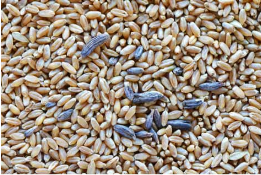
Figure 2. Ergot-contaminated wheat grain.

losses in wheat due to ergot are rare. In 1921, significant losses occurred in durum wheat in the northwestern United States. In 2011, ergot caused economic losses in south central and southeast Nebraska. The major significance of the disease, however, is that the sclerotia are poisonous to humans who eat contaminated food, and animals that consume contaminated feed.