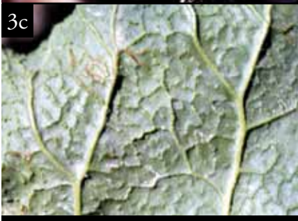
3. Beet Curl Top