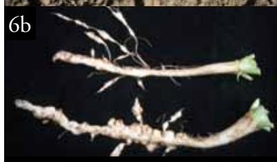
6. False Root-Knot