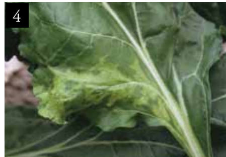
4. Beet Soilborne Mosaic