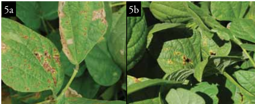
5. Brown Spot