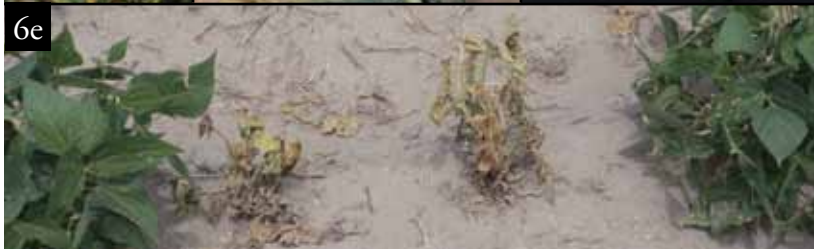
6. Bacterial Wilt