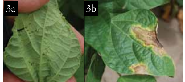
3. Common Blight