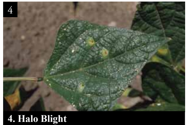
4. Halo Blight