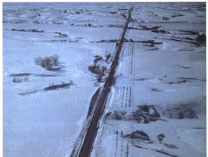
Living snowfences located along the north side of a highway will reduce time and energy costs associated with snow removal and improve winter driving conditions.

Areas or fields vulnerable to wind erosion during the winter offer additional challenges since field windbreaks with a density below 40 percent provide little protection for the soil resource. If the field is covered with snow the soil resource is protected, however, many areas where snow is an important source of water do not have continuous winter snow cover and therefore additional