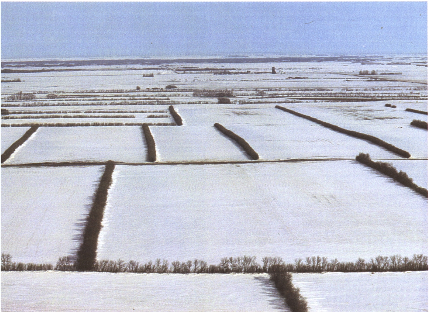
A windbreak across a large field distributes snow throughout the field, providing winter protection and moisture for crop production.

density. There is no one set design, number of rows, or width of planting that is ideal for every circumstance. The design of your tree planting should be done with your needs and winter conditions in mind. In some cases, landowners may choose to relocate fences, driveways, or feedlots in order to take full advantage of their windbreak. Remember, a tree planting is a long-term investment and it pays to consider all alternative designs before installation.