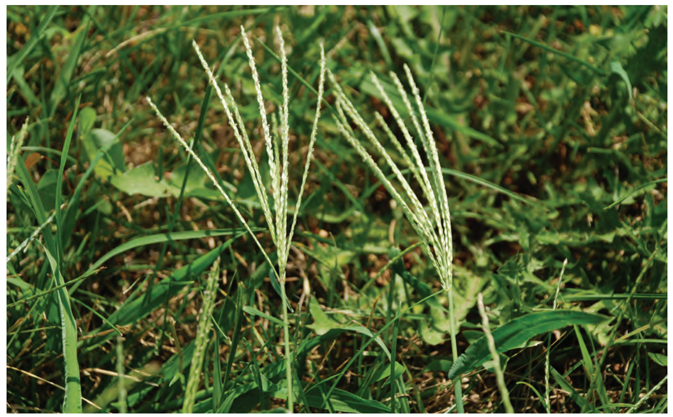
Figure 2. One crabgrass plant can produce 150,000 seeds per year. One year of not controlling crabgrass can result in many years of crabgrass problems due to the number of weed seeds available in the soil seedbank.