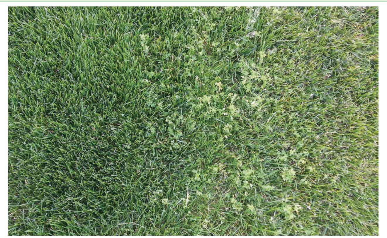
Figure 3. Weeds are good indicators of mismanagement. The left half of the photo shows a weed-free Kentucky bluegrass lawn managed with adequate nitrogen and water. The adjacent lawn, on the right, is managed with very little nitrogen and irrigation, and has a heavy infestation of yellow woodsorrel.