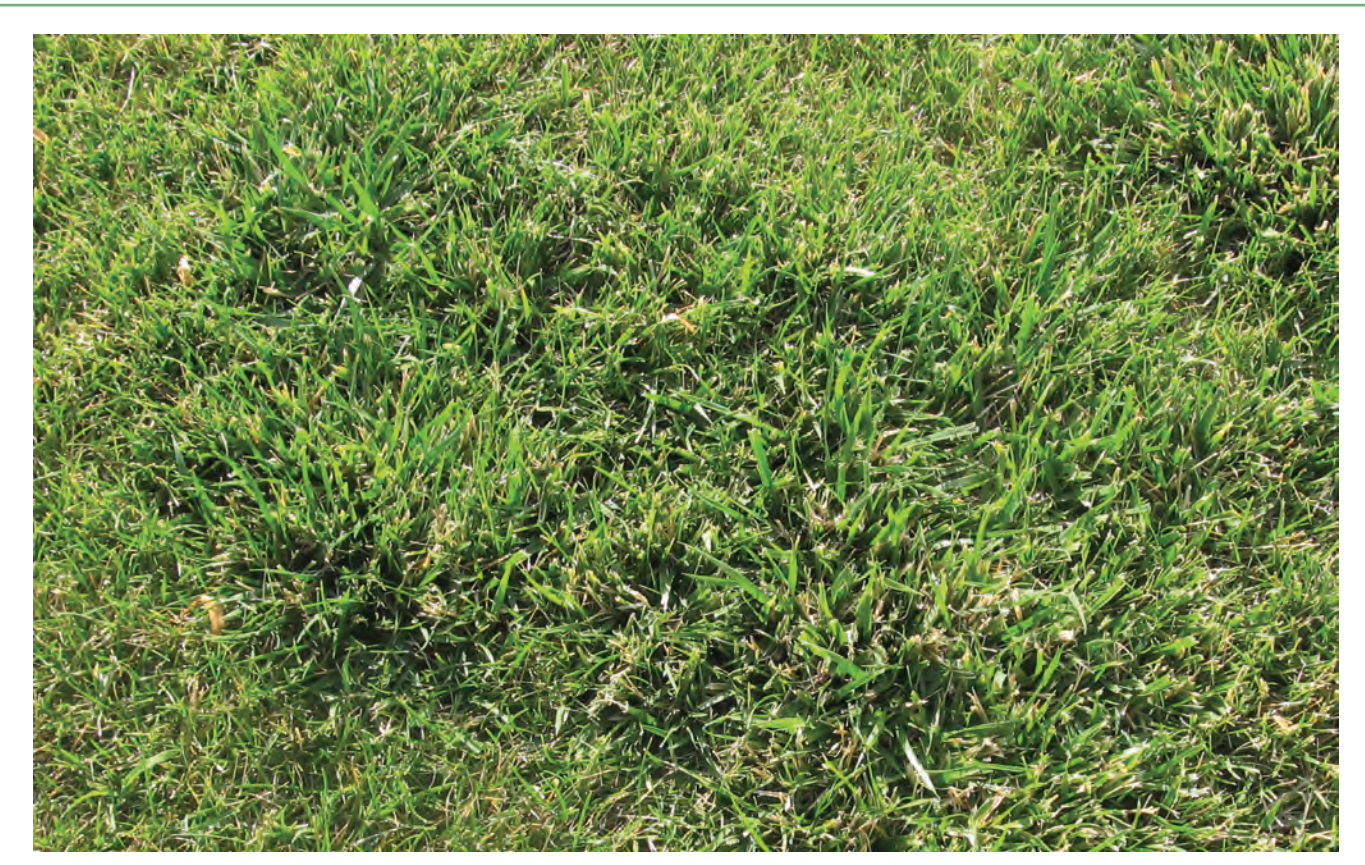
Figure 1. Although tall fescue is a desirable turfgrass species, it may be considered a weed if it infests a finer textured Kentucky bluegrass lawn.

or improper management. Weeds are opportunistic and readily become established in thin, weak turfgrass stands or landscape beds. Select and place plants that are adapted to the site conditions and will meet users' expectations and management requirements. If placed and managed properly, turfgrass and other landscape plants will cover and shade the ground, making weed germination and survival difficult.