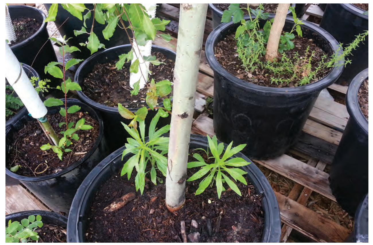
Figure 5. Weeds brought into a landscape from containers can quickly multiply and become a problem throughout the landscape.