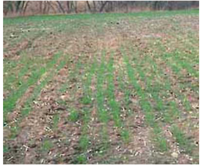
Figure 3. Severe root and crown rot. Plants killed by root and crown rot.

1. Plant winter wheat at the recommended date. Early planting favors good plant establishment that helps control wind erosion; however, heavy fall growth can seriously deplete soil moisture reserves. In the spring, root and crown rot abounds in early planted wheat because of drought stress. Late planting conserves moisture, but if there is too little soil protection due