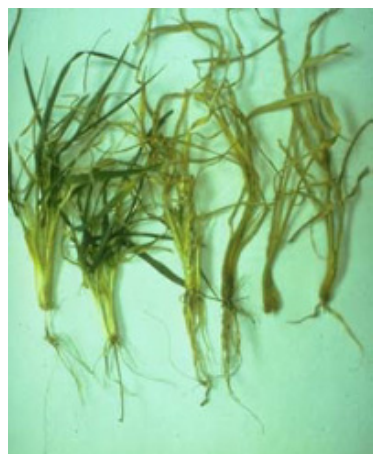
Figure 1. Stages of crown and root rot from healthy (left) to complete deterioration.

The growth and development of winter wheat is limited by temperature, growing degree days, available water, soil fertility, and disease and pest outbreaks. Besides the cap placed on yield by climate and soils, limitations are imposed by weather-related episodes such as winterkill, freeze injury, drought, or heat stress at critical times of plant development. Although the wheat plant compensates for many of these stresses, each can lower yield.