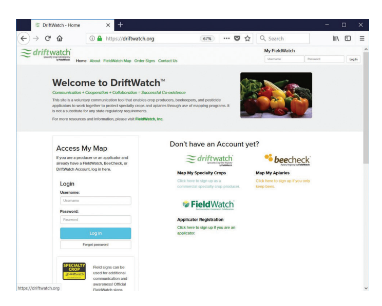
Figure 5. DriftWatch and BeeCheck encourage commercial producers to register locations of beehives.

Contact local beekeepers and obtain locations of