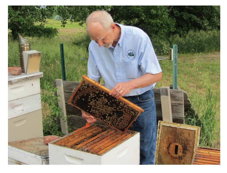
Figure 4. Notify beekeepers when you will be applying a product that is toxic to bees.

Although bees don't prefer corn pollen and it has limited nutritive value, they may collect pollen from tassels in the early morning but are not present in the afternoon or evening. Short-residual materials applied from late afternoon