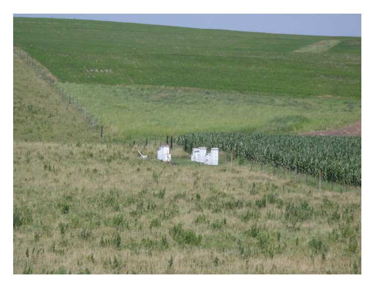
Figure 7. Hives shouldn't be placed near crops likely to be sprayed with pesticides.

Use DriftWatch. The Nebraska Department of Agriculture (NDA) subscribes to a web-based locator for sensitive commercial crops and beehives (Figure 5). The site consists of three programs: DriftWatch, for those who raise sensitive crops (organic, grapes, bees, etc.); BeeCheck, where beekeepers can register just hives; and FieldWatch, where pesticide applicators register to receive notification of new crops as they are registered in BeeCheck and DriftWatch. These three programs all fall under the name of DriftWatch, the original program. The site is not intended for homeowners or sites less than 1/2 acre. This site can be accessed at http://www .driftwatch.org. Beekeepers are encouraged to register the locations of their hives, and pesticide applicators are encouraged to use this website to determine if any beehives are located near a planned pesticide application site (Figure 6). Many beekeepers have provided their contact information on