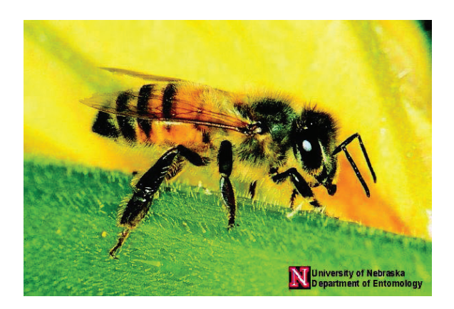
Figure 1. Honeybee

Honey bees ( Figure 1 ) are hairy, yellow, and black or brown banded social insects that are about 1/2 inch long on average and live in hives. Each individual has distinct duties, either as a worker (serving as a nursemaid, housekeeper, or forager) or a reproductive bee (drone or queen).