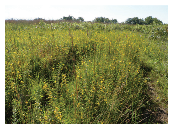
Figure 3. Partridge pea planted in an uncultivated area serves as bee forage.

Examine fields before spraying to determine if bees are foraging on flowering weeds. Milkweed, smartweed, henbit, and dandelion are examples of weeds that are highly attractive to honey bees. Milkweed is the only food source for monarch butterfly larvae, which are declining in numbers.