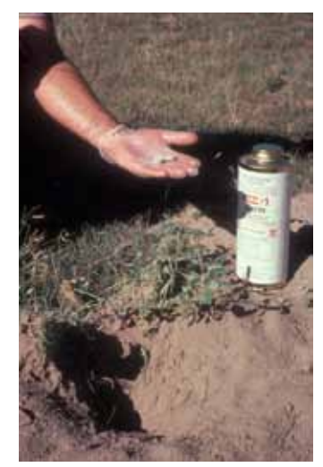
Figure 4. Aluminum phosphide applied to the burrow of a prairie dog.

AP tablets should be rolled deep down into prairie dog burrows, where they will react with moisture in the air and release phosphine gas (Figure 4). Place crumpled newspaper, a dry cowpie, or slice of sod in the burrow entrance (to prevent soil from smothering the tablets), then shovel loose soil over the burrow entrance to contain the fumigant in the burrow. AP activates more quickly with high soil moisture and temperature, so it is most effective when used in early spring as a follow-up to toxic baits. Wear cotton gloves and long sleeves when applying AP. Avoid breathing the fumes. Keep the container closed as much as possible and work into