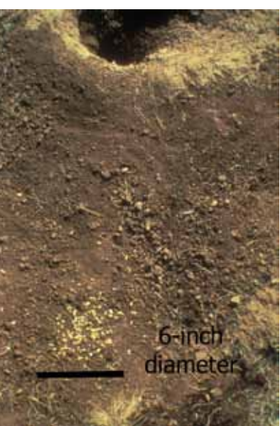
Figure 3. Toxic bait should be scattered over a 6-inch circle at each burrow entrance.

Prebaiting. Before applying ZP baits, you must first "pre-bait" burrows with untreated, clean, and fresh rolled or crimped oats. Prebaiting will habituate prairie dogs to grain and will make the ZP-treated bait much more effective when it is applied. Drop a heaping teaspoon (4 grams) of oats on the edge of each prairie dog mound or in an adjacent feeding area. The bait should scatter, forming a 6-inch circle (Figure 3). Do not place ZP baits in piles or inside burrows, on top of mounds, in piles of droppings, or in vegetation away from the mound. Following this