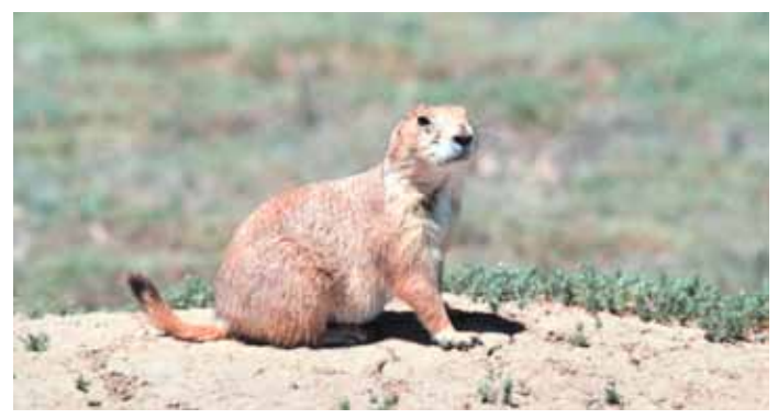
Figure 1. Black-tailed prairie dogs, Cynomys ludovicianus .

Prairie dog towns consist of social groups called "coteries" that typically contain 1 or 2 adult males, up to 6 adult females, and several yearlings and juveniles. Almost all mating occurs among unrelated individuals within a coterie. Black-tailed prairie dogs mature in 1 year, but most don't breed until they are over 1½ years