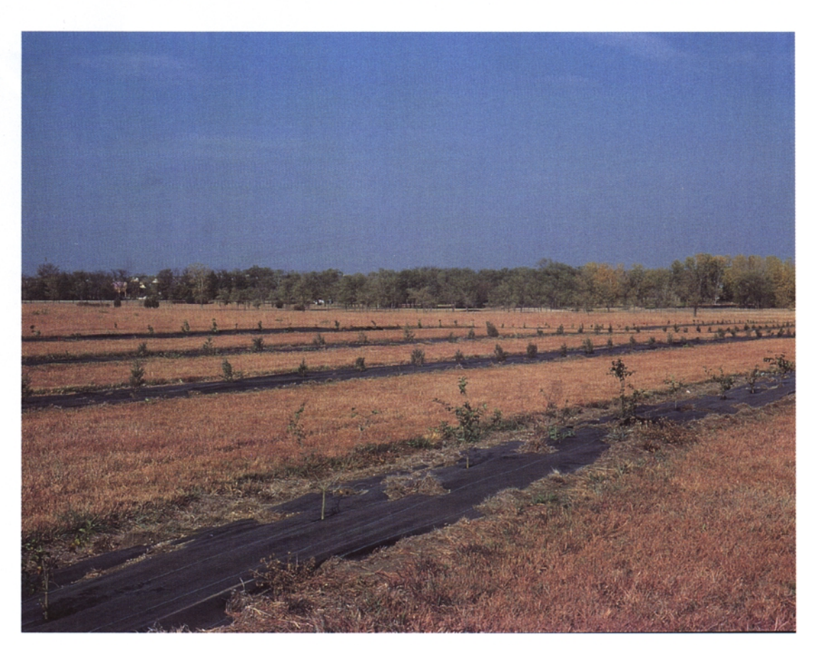
Landscape fabrics reduce the labor required for weed control and offer many advantages in dry or remote areas where other measures are impractical.

Avoid clean cultivation between the rows on soils prone to wind erosion. Instead, plant an annual cover crop such as corn, sorghum, or sudan grass between the windbreak rows and on each side of the windbreak to control soil erosion and protect the soil and young plants from the wind. These strips will trap snow, providing moisture to the new windbreak and valuable