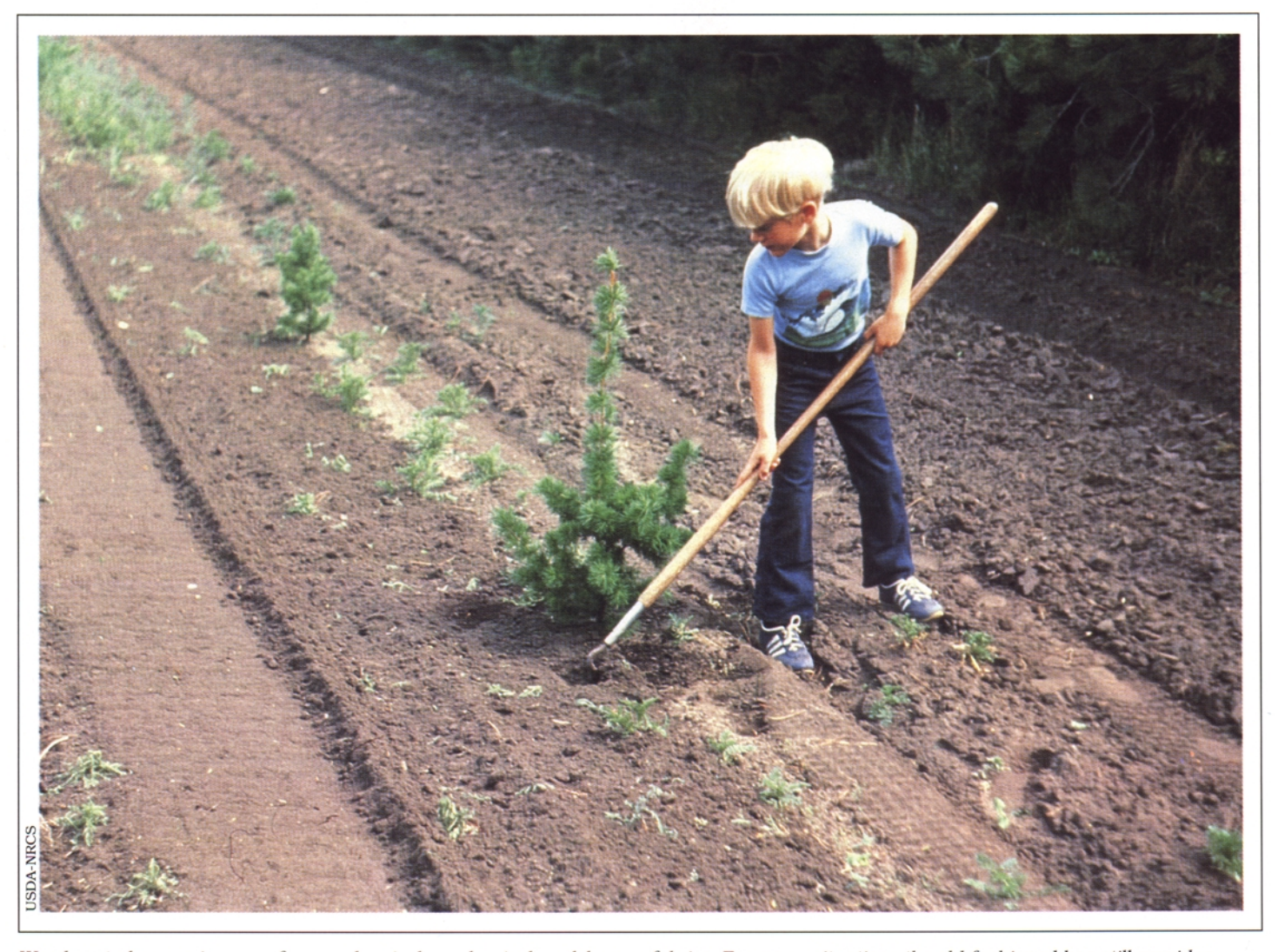
Weed control comes in many forms—chemical, mechanical, mulches, or fabrics. For many situations the old fashioned hoe still provides the best weed control possible.

the health and vigor of individual trees and shrubs while maintaining the overall structure of the windbreak as an effective wind barrier. To accomplish this goal, practices such as weed control, protection from large animals and rodents, corrective pruning, insect and disease control, and proper chemical use in nearby fields and farmstead areas need to be included in your management plan. With proper care, a windbreak will serve a long life of protection while providing wildlife habitat and adding beauty to the landscape.