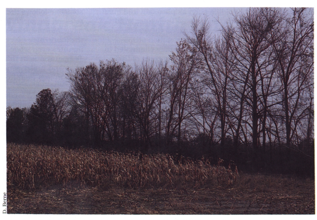
In many areas fencerows have grown up with native trees and shrubs. Instead of removing these trees they can be managed to provide excellent windbreaks.

Windbreaks are an integral part of many farming and ranching operations. All windbreaks, even well designed ones, need regular maintenance beginning the