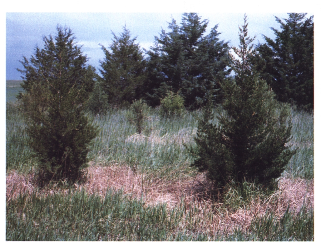
Sod forming grasses compete for moisture and nutrients and reduce tree growth rates. In older windbreaks contact herbicides are an effective control method.

The density and position of tree crowns change in relation to height above ground and neighboring trees. Most of these changes are small and with good planning your windbreak will continue to meet your objectives. Occasionally, these changes may affect the overall windbreak structure to the point that the windbreak no longer meets your objectives. In this case some type of structure management may be required. For example, if the windbreak is too dense, structure can be significantly altered by careful tree removal. Similarly, if the windbreak is not dense enough, interplanting or underplanting may be needed. This type of management is very tricky and it is extremely important to keep your objective in mind. It is best to get the advice of an expert before undertaking this type of windbreak management.