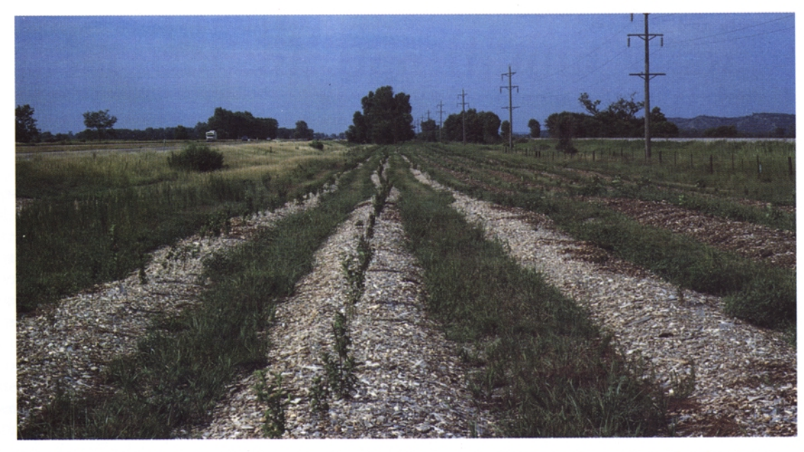
Wood chip mulches are an attractive alternative to cultivation or herbicides and provide good soil moisture conservation and weed control.

Livestock benefit from the protection provided by a windbreak, however, grazing livestock within the windbreak will cause serious damage to your investment. Damage from trampling, browsing, and breakage leads to slower growth, weakened trees, and premature death. When livestock congregate near trees, soil compaction can cause problems by limiting the amount of water and oxygen available to tree roots. All windbreaks located in areas where