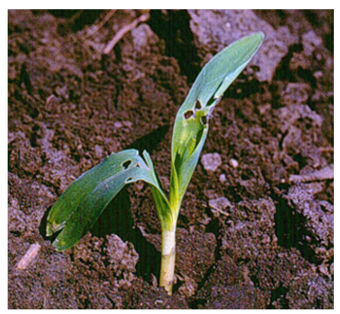
Figure 3. Leaf feeding by small black cutworms on corn.