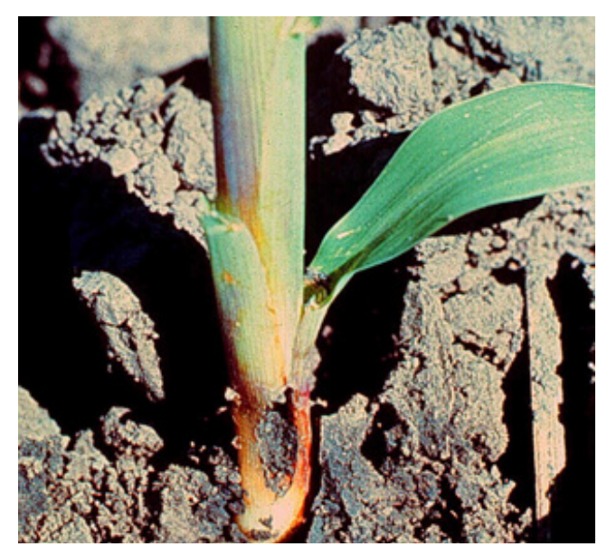
Figure 4. Cutting at the base of corn plant by black cutworms.

Economic thresholds have not been researched for this insect, but use of thresholds similar to those for cutworms has been suggested. The same insecticides