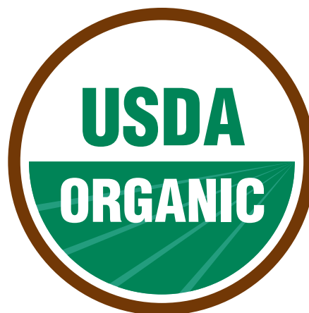
Figure 3. The USDA Organic Seal may be used only for certified organic agricultural products.

Organic Crops. Organic producers adhere to stringent USDA standards in order for their crops to be labeled "Certified Organic." This requires careful, long-term planning and alternative inputs, offset by increased market value of their certified product. By regulation, crops grown organically cannot be equipped with genetic engineering, such as herbicide-resistance traits. In addition, land used for organic production must be free of prohibited material (including synthetic pesticides and fertilizers) for at least 3 years prior to harvest. Pesticide drift can not only damage these vulnerable crops, it can cause a grower to lose their organic certification, which can cost them years of income from the organic market. (Personal communication: Gary Lesoing, Nebraska Extension Educator)