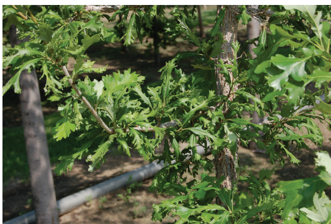
Figure 4. A bur oak tree in a nursery with abnormal growth after suspected herbicide drift injury. Note the branch (center, upper left) that has dramatically altered its growing angle. The tree is likely unsaleable.

Trees. Trees are valued for many reasons in Nebraska. They form windbreaks, produce fruit and nuts, and serve as ornamentals, to name a few. There are well over 3 million acres of trees in the state. Trees sold as nursery stock can take several years to reach saleable sizes, and, in Nebraska, hold an average value of more than $100 per tree (USDA National Agricultural Statistics Service). Many hold a value much higher. A significant number of trees are inadvertently exposed to herbicides due to drift and root uptake. While injury may sometimes seem minor or superficial, it can easily render nursery stock unsuitable for sale. Repeated exposure over several years can take a heavy toll on the life of a tree. For more information from the Nebraska Forest Service, visit https://nfs.unl.edu/publications/herbicide-damage-trees .