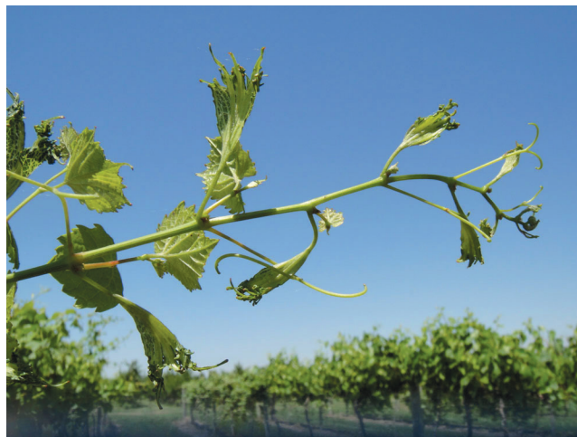
Figure 5. A young grape shoot injured by 2,4-D (Bruce Bordelon, Purdue University).

Hops. The craft beer industry has experienced dramatic growth in the past decade. With this growth has come increased interest among Nebraska brewers in using locally sourced ingredients, such as hops, in their beers. Depending on the variety and post-harvest processing, hops have an annual value of $15,000 to $22,000 per acre. Acreage devoted to hop production in Nebraska has steadily increased