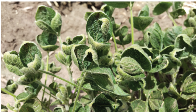
Figure 2. Soybean leaves showing signs of dicamba injury.

Non-GMO Soybeans. Despite the continued influx of soybeans equipped with herbicide-resistant technology, producers should be mindful of conventional soybean varieties grown in their area. Drift damage on non-GMO soybeans can be devastating. When planning applications, never make assumptions about which bean varieties neighbors have chosen to plant.