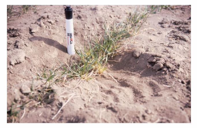
Figure 1. Blowing soil fills seed furrows and partially buries small wheat plants in the spring, resulting in increased plant stress that weakens the plants and makes them more susceptible to further damage by disease and other environmental stresses.

A strong, turbulent wind, coupled with highly erodible field conditions, causes wind erosion. A wind speed as low as 6 mph one foot above the soil surface is capable of starting soil movement under highly erodible field conditions. Erodible field conditions consist of an unprotected soil surface that is smooth, bare, loose, dry, and finely granulated ( Figure 1 ). If