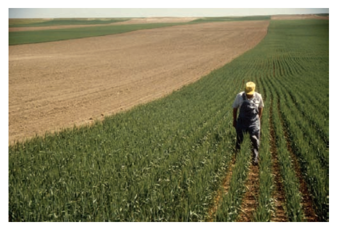
Figure 4. Stripcropping is a common practice in the Nebraska Panhandle to reduce wind erosion and winter-kill problems. Soil type is one factor that determines the width of the strips. Strips should be arranged perpendicular to the prevailing wind direction.

Irrigated crops like sugarbeet and dry bean leave little residue cover. A cover crop such as winter wheat or winter rye may be planted after dry bean to provide soil cover, but the crop must be planted early enough (by mid-September) to allow sufficient establishment of the cover crop to prevent soil blowing during the winter and early spring. To increase the odds of success with a fall cover crop, growers may want to consider planting a short season dry bean variety in late May to help assure an early harvest. Irrigation before planting the cover crop should be considered if soil conditions are extremely dry in order to ensure consistent and uniform seeding depth and rapid crop emergence. The cover crop rows should be planted perpendicular to the prevailing wind direction, which is usually from the northwest. If using a disk drill, row spacings should be narrow (6 to 8 inches). Wider row spacings are acceptable if a hoe drill is used and ridges are formed. If crops are harvested too late in the season to allow for adequate establishment of a cover crop, producers should consider increasing surface roughness with tillage or by applying manure or crop residues.